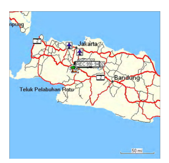
Figure 2. Study site in West Java of Indonesia

Field trips, and ecological observations of B. dulcis focused on trees, fruits and their habitat and interviews with the farmers were conducted two days a week during the harvest period, starting from February until April 2008 mostly in Bogor, Cianjur, Sukabumi, Tangerang, Depok, Bekasi and Purwakarta of West Java, Indonesia (Figure 2).