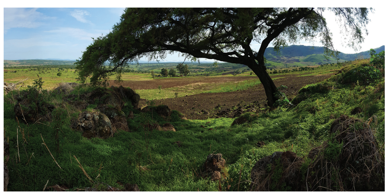
Figure 2. The ruins of farm Monte Verde, surrounded by eucalyptus trees (middle distance), overlay those of William Chapman's farm Monte Victoria-Verdun. Viewed from an intrusive rock outcrop on the lower northern slopes of Sandula Hill.

house " (Stassen 2010, p: 297). He called it Monte Victoria-Verdun (Stassen 2010, p: 25 notes it was originally called Sandula, but see below).