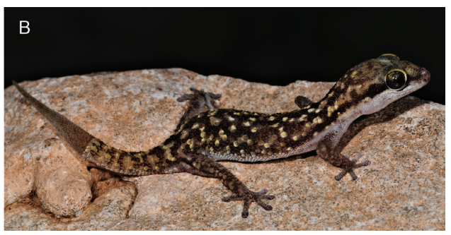
Figure 6. Regional variation in colouration of Pachydactylus angolensis from Angola. A P. angolensis – inland form (Serra da Tchivira) B P. angolensis – coastal form (Chimalavera Regional Natural Park).

al. (2016). The TM geckos from Iona and Espinheira have the characteristic narrow and dark-edged white nape band illustrated in Boone and Barts (2006) which is not evident in P. angolensis or mentioned in its description (Loveridge 1944). Thick-toed geckos (Pachydactylus) are poorly represented in Angola, with only seven currently recognized species recorded; P. cariculicus, P. scutatus, P. angolensis, P. punctatus, P. oreophilus, P rangei and P. vanzyli. This contrasts dramatically with Pachydactylus diversity in Namibia (38 species) and South Africa (30 species). Pachydactylus angolensis can be distinguished from most Angolan Pachydactylus (e.g. P. cariculicus, P. punctatus, P. rangei and P. vanzyli) by its keeled dorsal scalation, from P. oreophilus by its smaller size, and from P. scutatus by lacking a darkedged white nape band and by the exclusion of the first upper labial and rostral from the nostril (P. scutatus has a well developed nape band, and both the first upper labial and rostral enter the nostril).