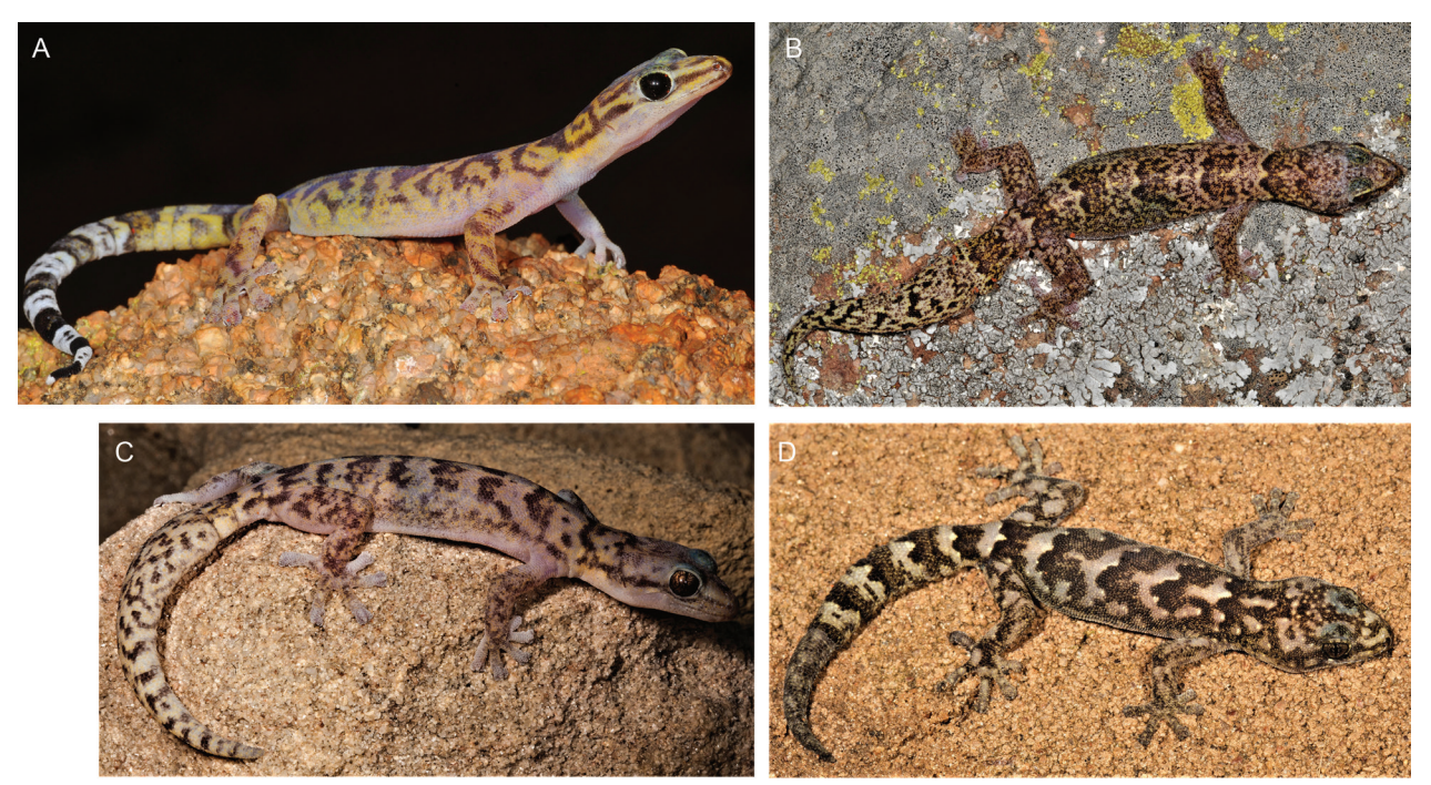
Figure 4. Regional variation in colouration and habitus of Afroedura bogerti from Angola A Omauha Lodge, Namibe Province B 52 km N Caraculo, Namibe Province C Praia do Meva, Benguela Province. D Candumbo Rocks, Huambo Province.

May 1974; TM 45374, 1 km south Luimbale, Huambo Province (12°15'13.3"S, 15°19'00.8"E), 10 May 1974; TM 45381–98 (18 specimens), Candumbo Rocks, 16 km west of Vila Nova, Huambo Province (12°44'09.6"S, 15°58'27.8"E), 11 May 1974; TM 46587–90 (four specimens), 3 km west of Bocoio, Benguela Province (12°28'58.0"S, 14°06'24.8"E), 28 May 1974; TM 46631–34 (four specimens), Numba (= Namba), on track from Atome to Cassongue (vicinity of Missão da Namba), Cuanza Sul Province (11°55'01.9"S, 14°51'39.1"E), 29 May 1974.