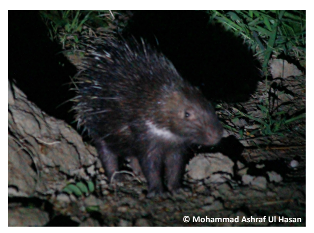
Image 2. Frontal view of the Himalayan Crestless Porcupine Hystrix brachyura showing its blunt muzzle, 24 May 2018.

First authentic record of Himalayan Crestless Porcupine in Bangladesh