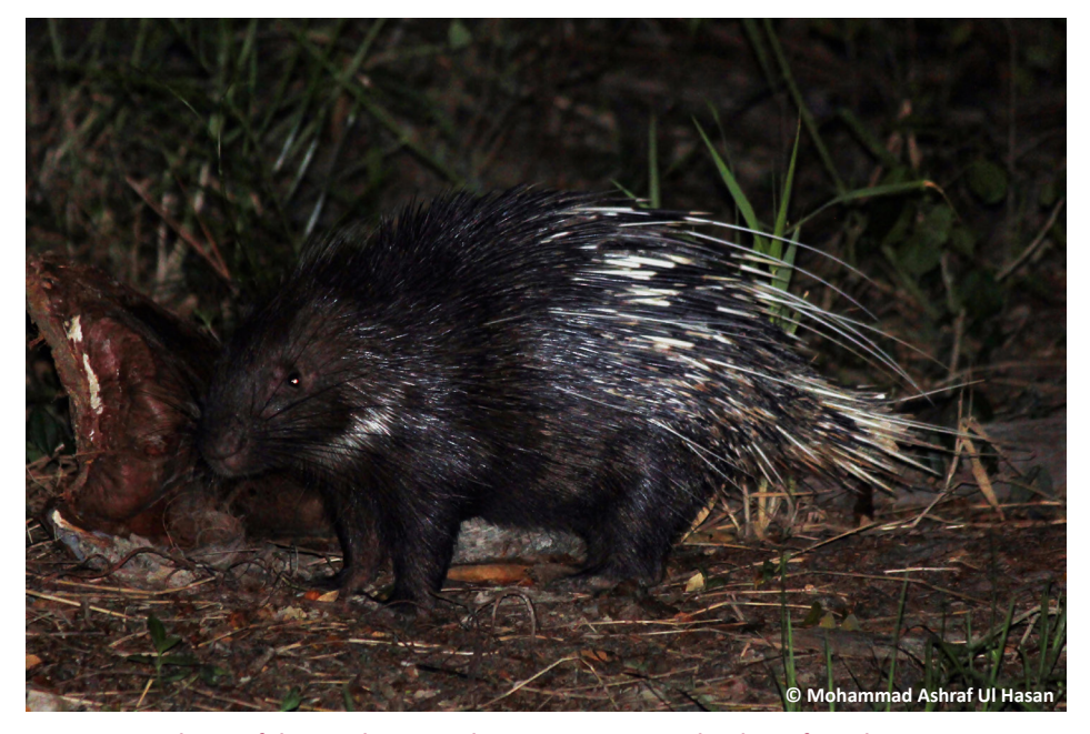
Image 1. Lateral view of the Himalayan Crestless Porcupine Hystrix brachyura from the Supoti Forest Camp, Sundarbans, Bangladesh on 24 May 2018.

Figure 1. Location of the Hystrix brachyura recorded from Sundarbans, Bangladesh.