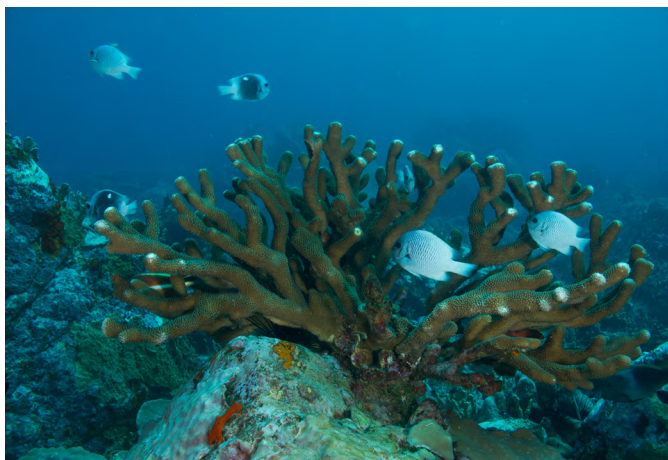
Figure 8. Dascyllus strasburgi finding shelter in a Pocillopora sp. colony.