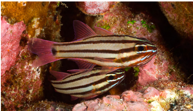
Figure 4. Ostorhinchus relativus .