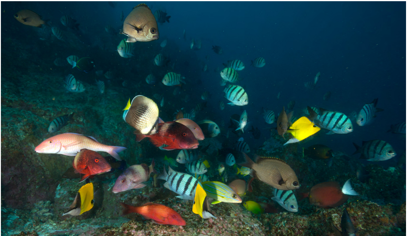
Figure 7. Two endemic species to the Marquesas Islands: Chromis flavapicis (black) and Abudefduf conformis (striped). Chaetodon trichrous (half black, half white and yellow tail) is endemic to French Polynesia.