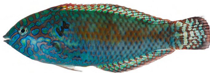
Figure 10. Macropharyngodon pakoko (male, 72 mm SL).