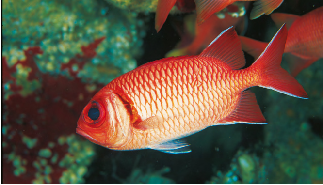
Figure 2. Myripristis cf botche . Photographed by Yves Lefèvre at -65 m, this Myripristis is closest to Myripristis blotche .