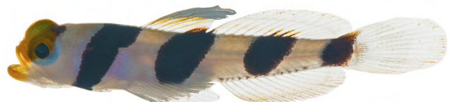
Figure 16. Stenogobius medon adult (19 mm SL, top) and juvenile (bottom, 15 mm SL).