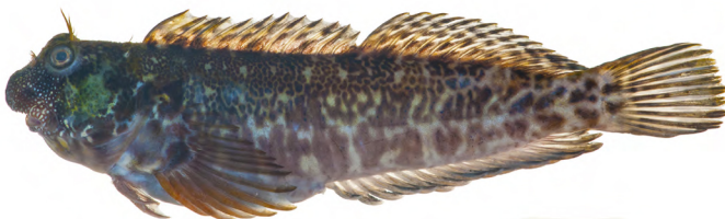
Figure 14. From top to bottom: Entomacrodus corneliae (40 mm SL), E. macropsilus (19 mm SL), E. randalli (109 mm SL).