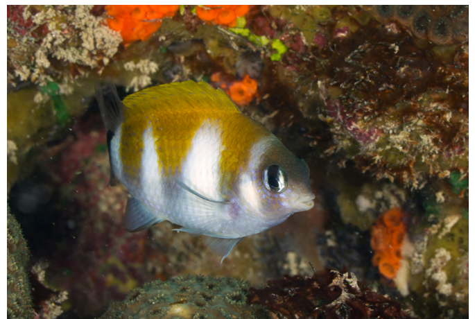
Figure 9. Plectroglyphidodon sagmarius .