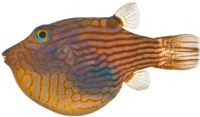
Figure 20. Canthigaster criobe (44 mm SL).

Marine Protected Area is in progress for the Marquesas Islands. Our study highlights the uniqueness of the Marquesan reef fish fauna and emphasizes the necessity to preserve the reef fish fauna of the archipelago, possessing the third highest percentage of endemism in the Indo-Pacific.