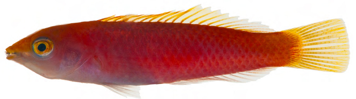
Figure 11. Pseudojuloides pyrius (32 mm SL).