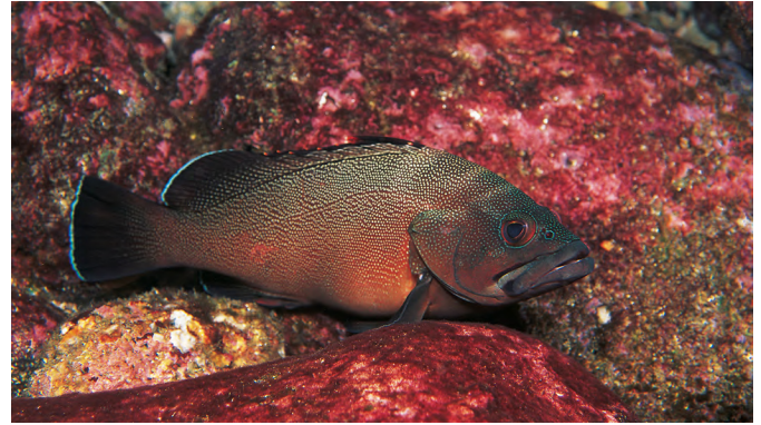
Figure 3. Epinephelus irroratus .