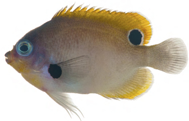
Figure 6. Paracentropyge multifasciata (58 mm SL, top), Centropyge nigrocella (36 mm SL, bottom).