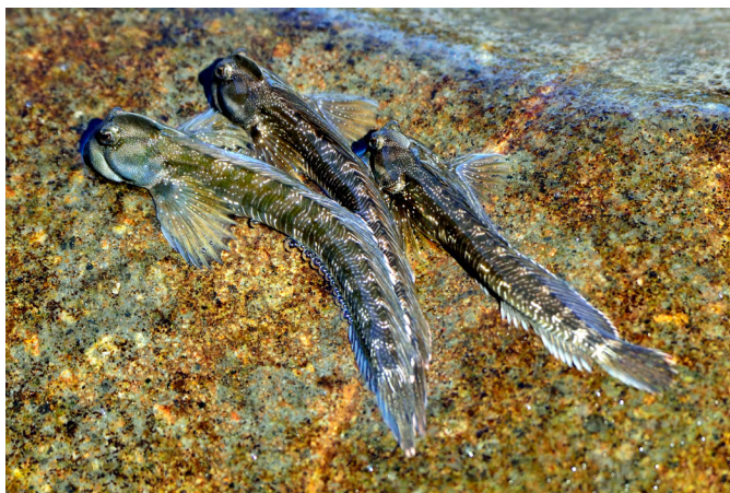
Figure 13. Alticus simplicirrus .