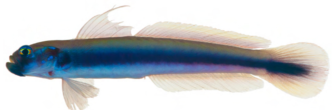
Figure 17. Ptereleotris melanopogon (76 mm SL).