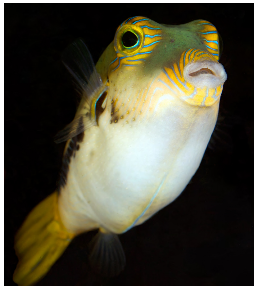
Figure 21. Canthigaster marquesensis.