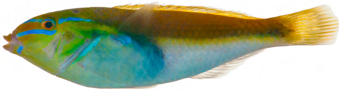
Figure 12. Stethojulis marquesensis (84 mm SL).

represented species endemic from the Marquesas (100% of endemism), and Congridae, Bothidae, Chlopsidae, Pempheridae (50%), all of them represented by no more than six species in total in the Marquesas. Among the five most speciose families; the percentage of endemism observed is uneven with 5.0% for Muraenidae, 20.0% for Labridae, 33.3% for Gobiidae, 3.9% for Acanthuridae and 27.3% for Serranidae.