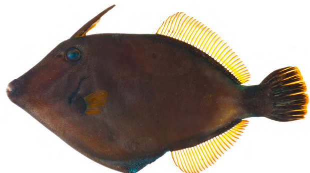
Figure 18. Cantherhines nukuhiva (160 mm SL).