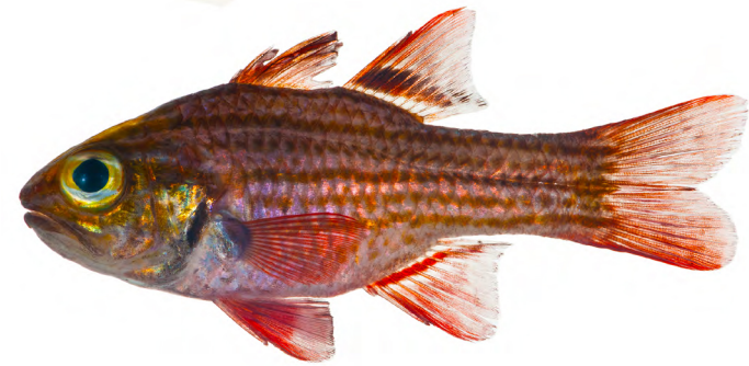
Figure 5. Ostorhinchus sinus (89mm SL).