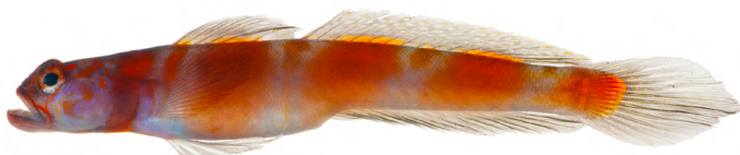
Figure 15. Amblyeleotris marquesas (69 mm SL).