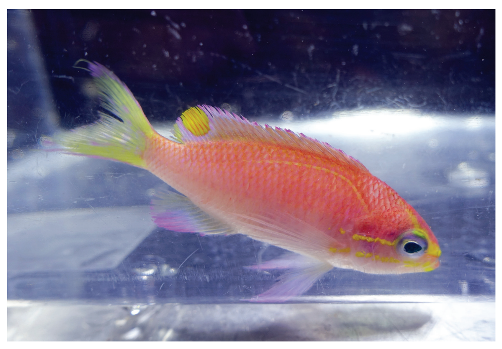
Figure 5. Holotype of Tosanoides obama shortly after collection, alive in a holding tank aboard the NOAA Ship Hi'ialakai .