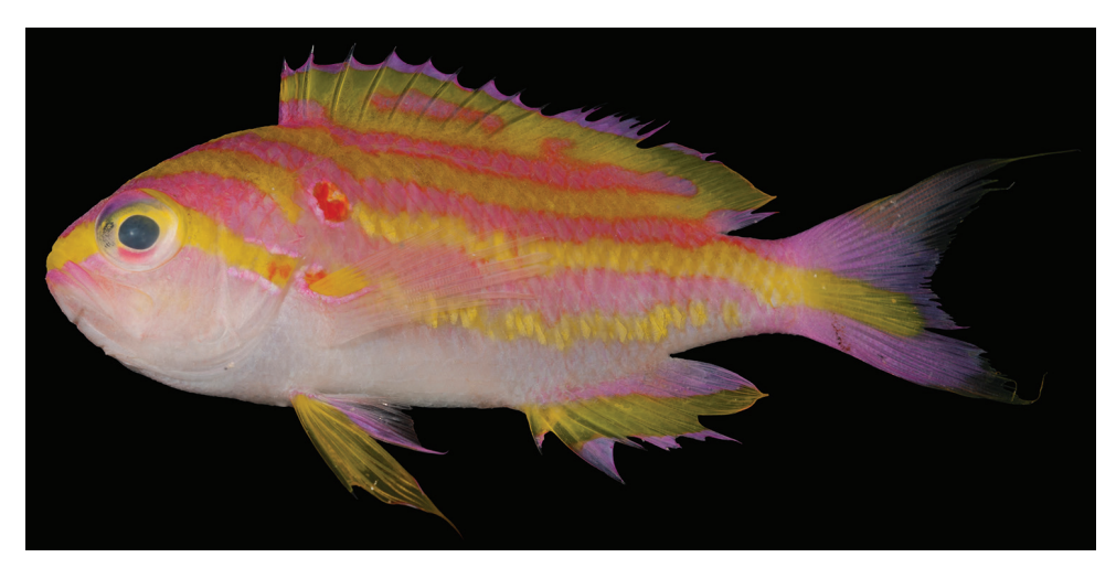
Figure 7. Tosanoides flavofasciatus, BPBM 40858, Palau Islands.

anterior three dorsal-fin spine lengths (4.29–4.17, 3.33–3.43 and 3.06–2.91 in head, compared with 2.03–1.84, 2.24–2.15 and 2.66–2.30 in head for T. filamentosus , and 3.57–3.21, 2.86–2.82 and 2.67–2.52 in head for T. flavofasciatus ), and in dorsal-fin profile (slightly notched in T. obama ). Tosanoides obama also differs from both other Tosanoides species in having far less scalation on the median fins (only basally, compared with one half or more of fins), and in the third anal-fin spine (approximately equal to second anal-fin spine, compared with a shorter and less stout third anal-fin spine relative to second anal-fin base (4.81–5.14 in SL, compared with 5.35–5.40), broader bony interorbital space (3.43–3.57 in head, compared with 4.44–4.63), and longer third anal-fin spine (1.85–2.50, compared with 2.55–3.19). Tosanoides flavofasciatus additionally differs from T. obama in having a deeper body (2.29-2.69 in SL, compared with 2.84–2.88).