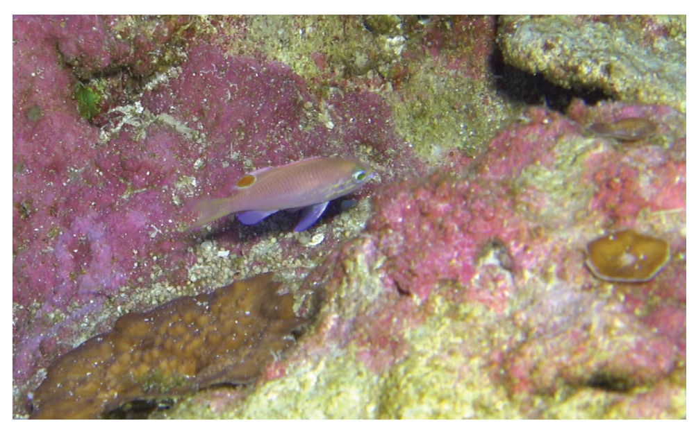
Figure 3. Holotype of Tosanoides obama immediately prior to collection, at a depth of 90 m off Kure Atoll, Northwestern Hawaiian Islands.