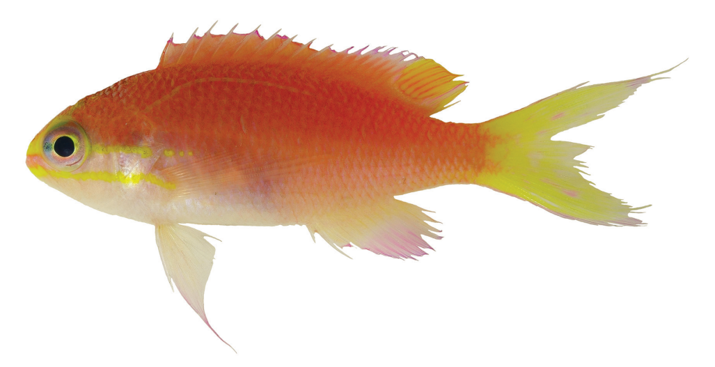
Figure 1. Holotype of Tosanoides obama (BPBM 41315), collected at a depth of 90 m off Kure Atoll, Northwestern Hawaiian Islands.