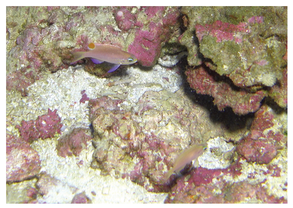
Figure 4. Holotype of Tosanoides obama (upper left) alongside presumed female (lower right, not collected) immediately prior to collection of the holotype, at a depth of 90 m off Kure Atoll, Northwestern Hawaiian Islands. Both fish retreated into the same hole moments after this image was captured. Cropped frame from video by R. L. Pyle.