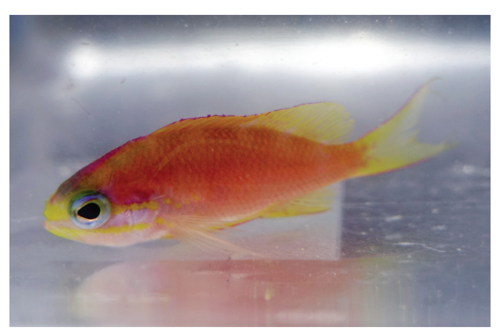
Figure 6. Paratype of Tosanoides obama shortly after collection, alive in a holding tank aboard the NOAA Ship Hi'ialakai .