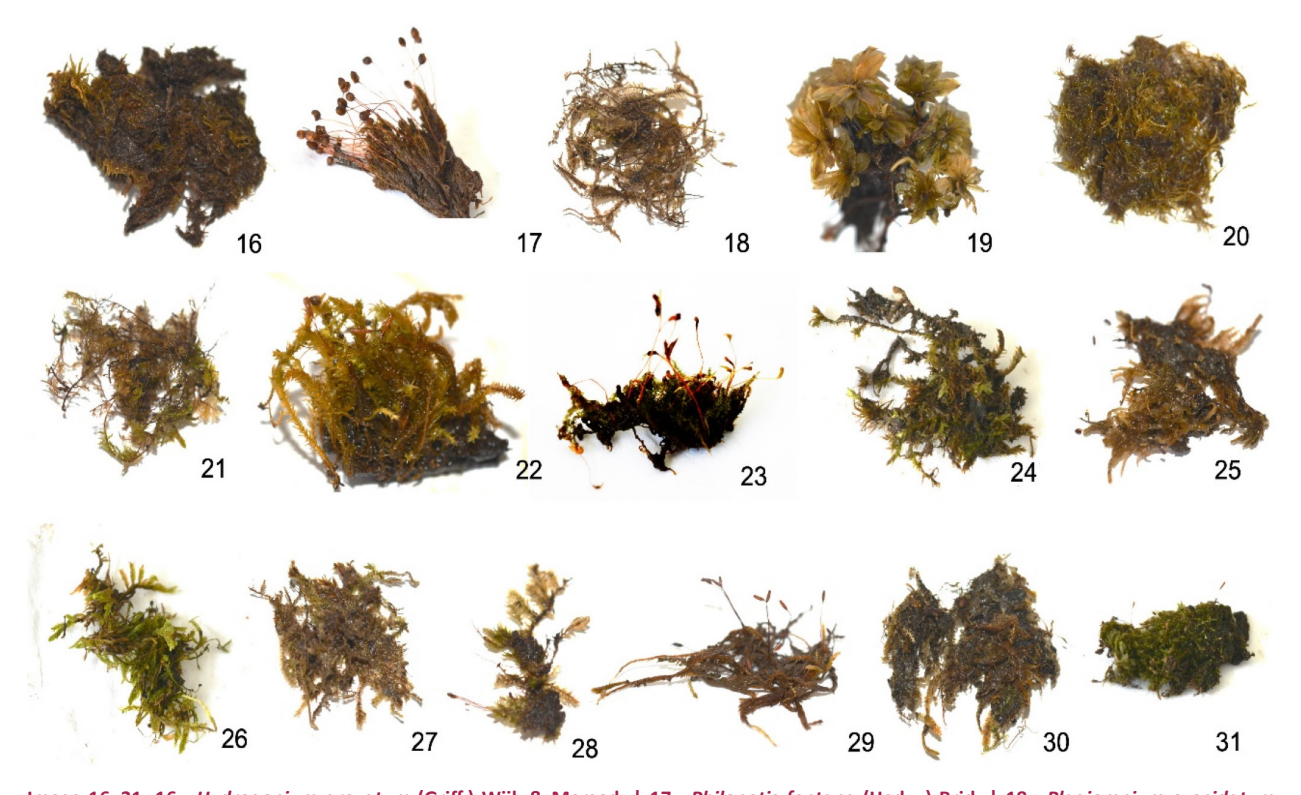
Image 16–31. 16—Hydrogonium arcuatum (Griff.) Wijk & Margad. | 17—Philonotis fontana (Hedw.) Brid. | 18—Plagiomnium cuspidatum (Hedw.) T.J.Kop | 19—Ptychostomum capillare (Hedw.) D.T.Holyoak & N.Pedersen | 20—Cratoneuron filicinum (Hedw.) Spruce | 21—Thuidium glaucinum (Mitt.) Bosch & Sande Lac. | 22—Herpatineuron toccoae (Sull. & Lesq.) Cardot | 23—Brachythecium buchananii (Hook.) A.Jaeger | 24—B. populeum (Hedw.) Schimp. | 25—Rhynchostegium populeum (Hedw.) Schimp. | 26—Oxyrrhynchium vagans (A.Jaeger) Ignatov & Huttunen | 27—Pseudotaxiphyllum elegans (Brid.) Z.Iwats. | 28—Entodon flavescens (Hook.) A.Jaeger | 29—E. myurus (Hook.) Hampe | 30—E. rubicundus (Mitt.) A.Jaeger | 31—Hypnum cupressiforme Hedw.

(Hook.) A. Jaeger, E. myurus (Hook.) Hampe, and E. rubicundus (Mitt.) A. Jaeger] were recorded. Entodon flavescens & E. myurus are terricolous and E. rubicundus is saxicolous in habitat. Plants thin, glossy, and found growing in mats. Branch leaves are smaller than stem leaves. Leaves lanceolate to ovate in shape. Laminal cells elongated rhomboidal, differentiated alar cells, double, short or absent costa is the most characteristic feature of the recorded taxa. Capsules are erect and cylindrical in shape. Peristome teeth are two-rowed.