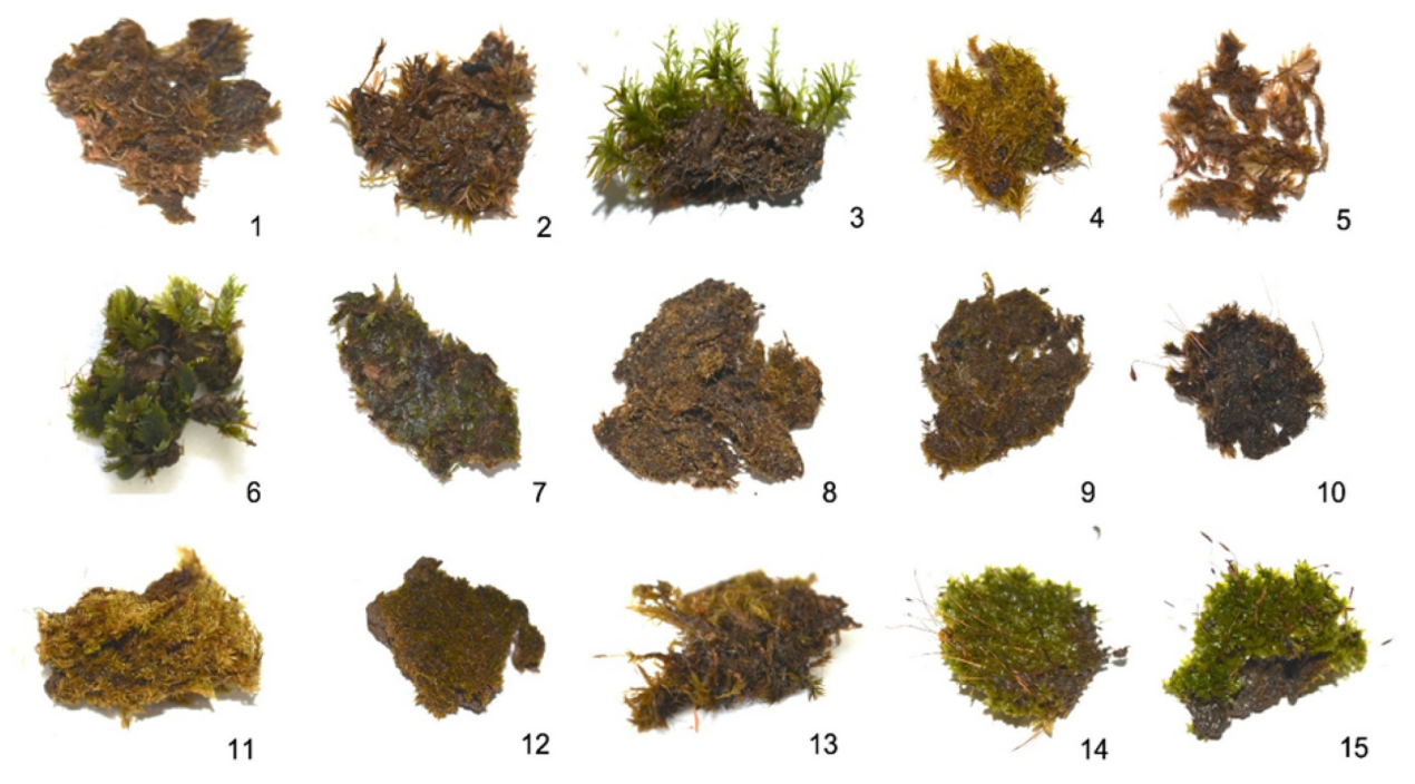
Image 1–15. 1—Atrichum undulatum (Hedw.) P.Beauv. | 2—A. flavisetum Mitt. | 3—A. obtusulum (Mull.Hal.) A.Jaeger | 4—Dicranella divaricata (Mitt.) A.Jaeger | 5—Fissidens bryoides Hedw. | 6—F. crispulus Brid. | 7—F. involutus Wilson ex Mitt. | 8—Ditrichum tortipes (Mitt.) Kuntze | 9—Rhabdoweisia crenulata (Mitt.) H.Jameson | 10—Anoectangium stracheyanum Mitt. | 11—A. bicolor Renauld & Cardot | 12—Molendoa roylei (Mitt.) Broth. | 13—Hymenostylium recurvirostrum (Hedw.) Dixon | 14—Hyophila involuta (Hook.) A. Jaeger | 15—H. rosea R.S.Williams.

Himalaya (Alam 2013). In the present study, only one taxon, i.e., Cratoneuron filicinum (Hedw.) Spurce was recorded. The stem leaves are broader than the branch leaves, lanceolate, acuminate, areolations elongated in the apical region and rhomboidal in the lower half. Peristome teeth are diplolepidous, hypnoid type.