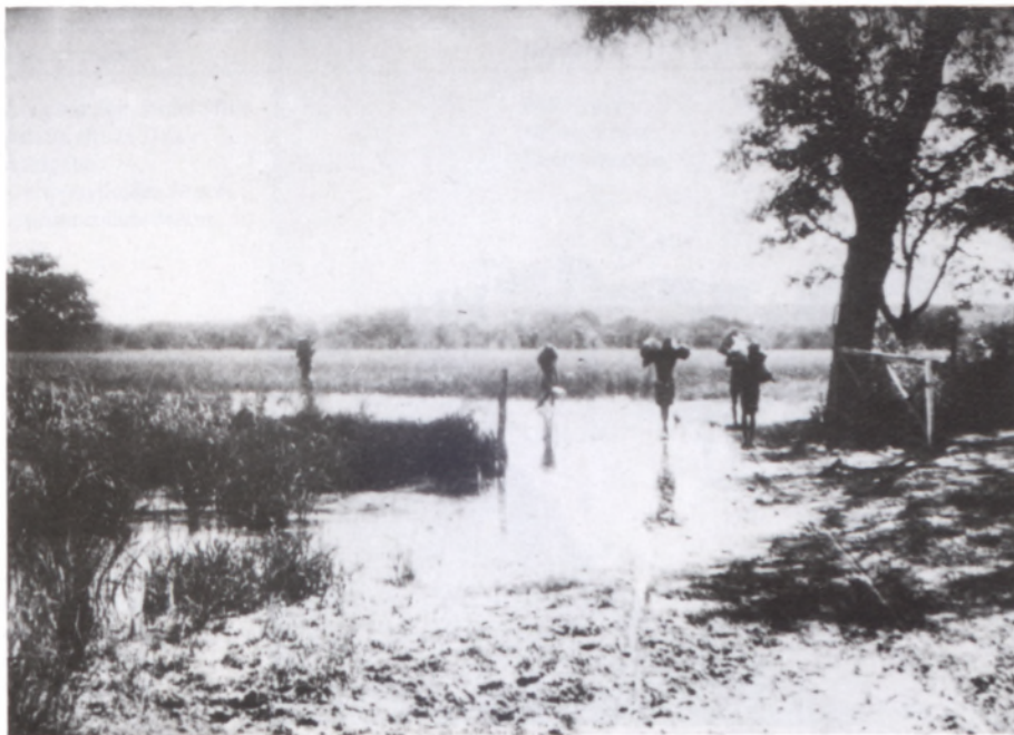
FIGURE 5.—The journey was often continued on foot with porters carrying all the equipment.