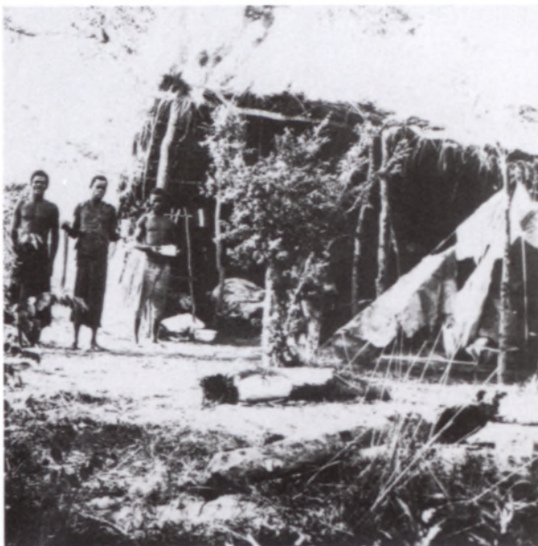
FIGURE 8.—A 'permanent' encampment (locality unknown).