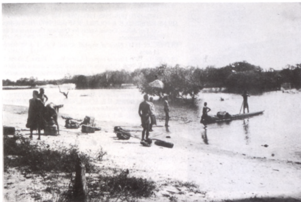
FIGURE 6.—Crossing the Luali River.