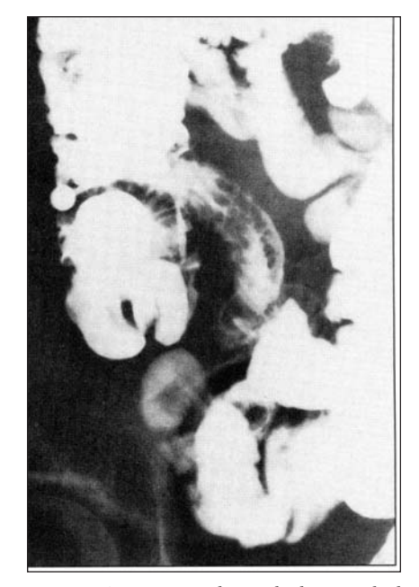
Figure 1) Barium radiograph showing ileal mucosal ulceration and narrowing with Crohn's disease

nally, vaginal or other cutaneous lesions (ie, erosions, ulcers) separated from the gastrointestinal tract by normal skin (ie, 'skip lesions') have very rarely been reported in Crohn's disease; in the case of genital disease, these are generally characterized by the absence of perineal and/or perianal disease and histologically by the presence of giant