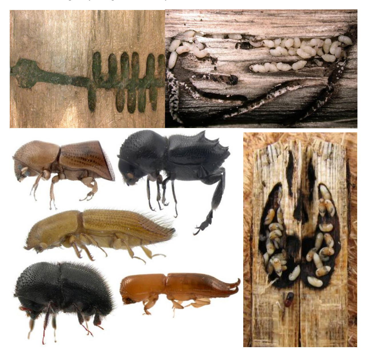
Figure 1. Examples of ambrosia beetles and their galleries. From left to right, top to bottom: Diuncus gallery; Trypodendron gallery; Xyleborina ambrosia beetles; Xylosandrus crassiusculus gallery.

Bark and ambrosia beetles are categorized by their use of host plant substrate, but there is no absolute distinction between the two groups and most are associated with fungi to some extent. Most ambrosia beetles construct galleries in the sapwood of trees (Figure 1). The term 'ambrosia' refers to the fungal gardens the beetles cultivate on their gallery walls and use as an exclusive food source [16,33]. The beetles are obligately dependent upon the fungi, from which they acquire amino acids, vitamins and sterols [16,33]. The activities of female beetles have been hypothesized to control the growth and composition of ambrosial gardens. If the female dies, the garden is quickly overgrown by contaminating fungi and bacteria, which ultimately results in the death of the brood [26,34]. The activities of the larvae may also control non-mutualistic fungi, although the mechanism for this is unknown (X). Dispersing adult beetles transport the fungi to new host trees in highly specialized structures of the exoskeleton called mycangia (Figure 2), thus maintaining the association from