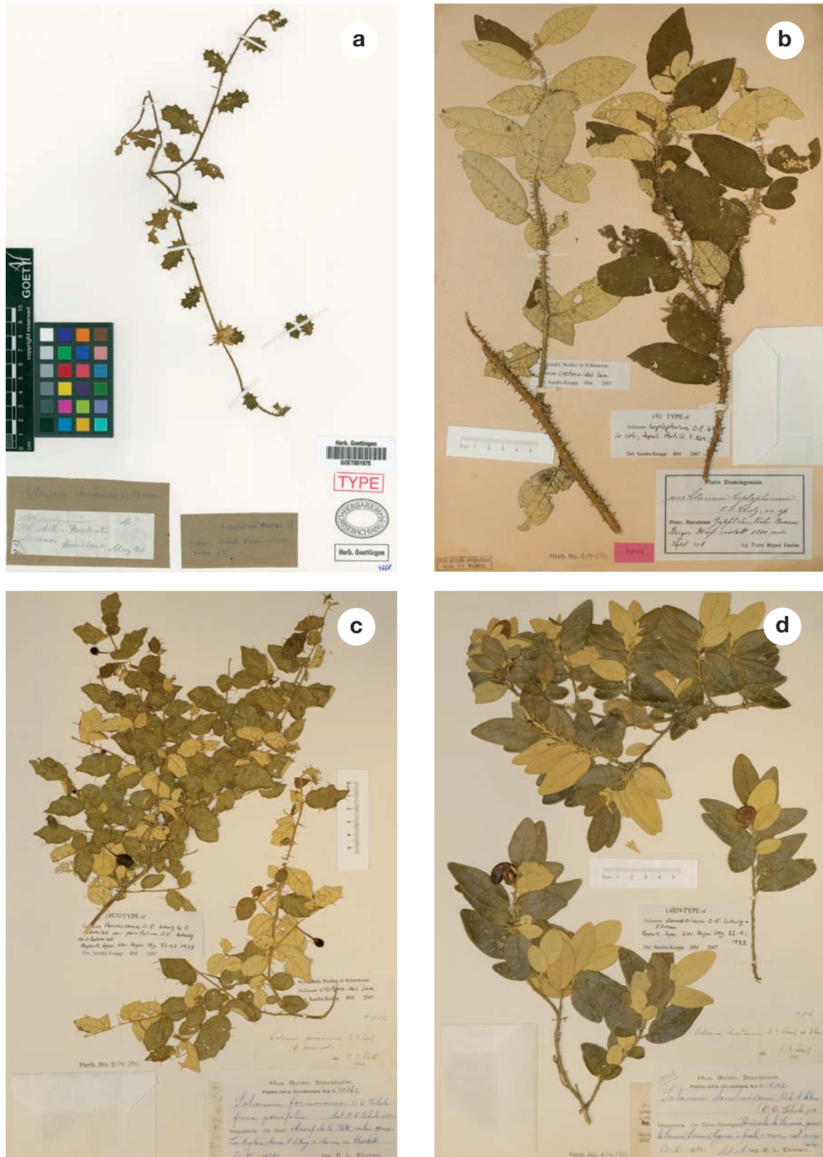
Fig. 2. a , lectotype of Solanum chamaeacanthum Griseb., Wright s.n. (GOET0001971); b , lectotype of S. hoplophorum O.E. Schulz, Fuertes 1023 (S04-2916) (= S. crotonoides Lam.). Reproduced with permission of the Swedish Museum of Natural History; c , lectotype of S. formonense O.E. Schulz and of S. formonense var. parvifolium O.E. Schulz, Ekman H.10265 (S04-2911) (= S. crotonoides Lam.). Reproduced with permission of the Swedish Museum of Natural History; d , lectotype of S. dendroicum O.E.Schulz & Ekman, Ekman H.15102 (S04-2902). Reproduced with permission of the Swedish Museum of Natural History.