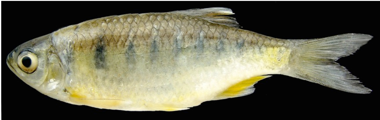
Image 1. Barilius profundus sp. nov., side view of paratype, MUMF 27021, 69.9mm SL

following Hollister (1934). Vertebral counts follow Weitzman (1962). Fin rays were counted under a stereo-zoom light microscope. Type specimens are deposited in the Manipur University Museum of Fishes (MUMF).