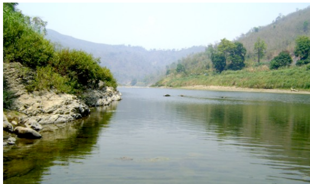
Image 2. Koladyne River at Kolchaw, Mizoram, habitat of Barilius profundus sp. nov.

fin hyaline with a row of elongated black marks. Pectoral, pelvic and anal fins golden yellow with hyaline distal margins. Caudal fin edged with black, faintly yellowish-green at the base.