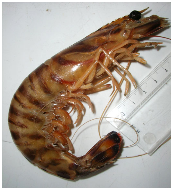
Figure 1. Japanese or kuruma prawn Marsupenaeus ( Penaeus) japonicus, male, 190mm TL, 42g, Bay of Quiberon, Brittany, NW France, 16.05.2005.