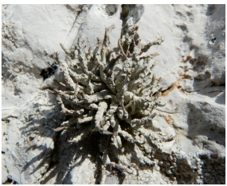
Figure 1. Ramalina implexa (left, photo P.L. Nimis, TSB 5975) and Roccella phycopsis (right, photo A. Moro).

This manuscript reports the isolation and chemical and biological characterization of the main metabolites isolated from both lichens R. implexa and R. phycopsis , focusing the biological investigation of these metabolites on the antibiotic and nematocidal activities, the latter here reported for the first time for any lichen metabolite.