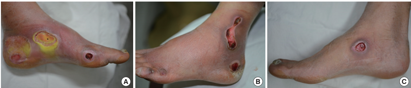
Fig. 1. Infectious change of the left foot. Two months after bullectomy, erythema and swelling were observed in the heel area (A) Medial aspect of left foot. (B) Lateral aspect of left foot. (C) Medial aspect of right foot.

At 8 weeks after the initial visit, two bullae developed on the