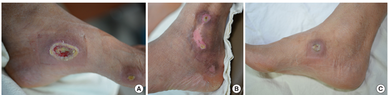
Fig. 4. Both feet after 16 weeks. Both feet show epithelialization of all wounds without any infection signs. (A) Medial aspect of left foot. (B) Lateral aspect of left foot. (C) Medial aspect of right foot.

Diagnosis of BD is a diagnosis of exclusion. The history reveals a nontraumatic, spontaneously occurring blister, one that may repeatedly occur in different sites of the body. This history will help exclude the commonly found frictional bullae that easily progresses to ulceration. There are no specific laboratory tests that aid diagnosis. Histopathologic findings are not very