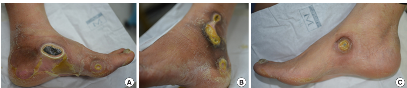
Fig. 2. Progression of the wounds. Demarcation is seen. (A) Medial aspect of left foot. (B) Lateral aspect of left foot. (C) Medial aspect of right foot.