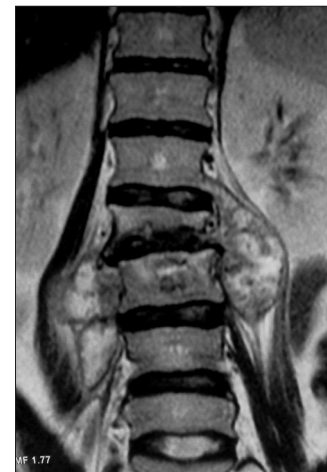
Figure 2: T2-weighted coronal MR image showing collapse of L1 vertebral body with irregularity of superior end plate of L2 along with bilateral psoas abscesses