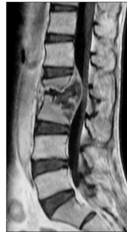
Figure 1: Contrast-enhanced T1-weighted sagittal magnetic resonance image showing destruction of L2 and L3 vertebral bodies with intraosseous and epidural abscess resulting in spinal canal stenosis

In contrast to most imaging methods, MRI has the advantages of improved contrast resolution for bone and soft tissues along with versatility of direct