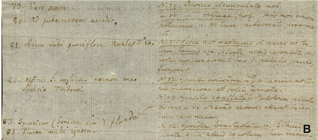
Figure 1. Letters to Cavanilles at the archive of the Real Jardín Botánico of Madrid. ( A ) Fragment of the letter (page 4) sent by Hoffmannsegg [44] in 27 April 1801; original list by Hoffmannsegg (left) with the later annotations of Cavanilles (right) and the check symbol (+) near the left edge. ( B ) Fragment of the letter (page 5) sent by Link [50] in 28 January 1799; original list by Link (right) and later annotations by Cavanilles (left) with the same number.