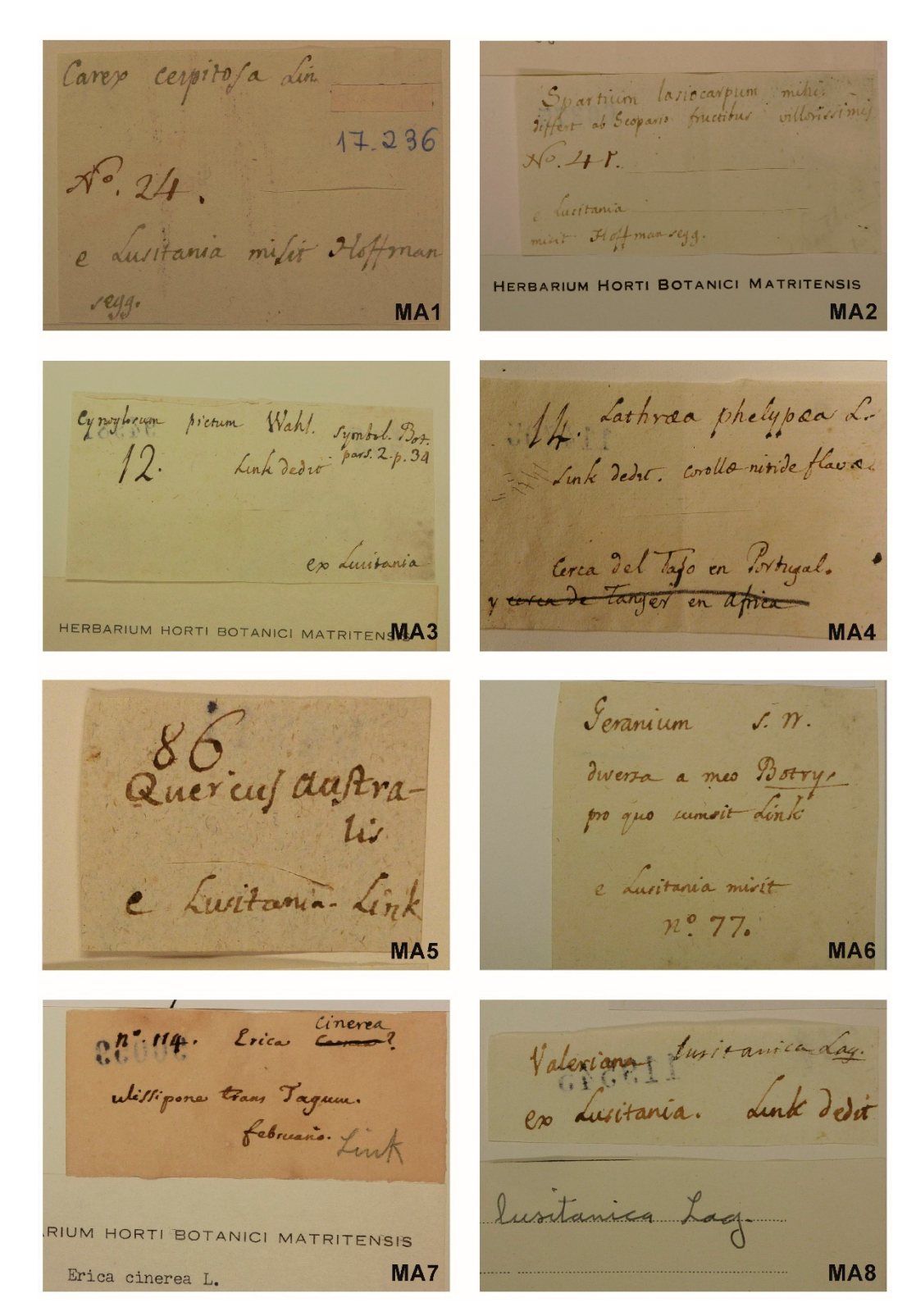
Figure 2. Examples of labels in the specimens of Hoffmannsegg and Link in the Herbarium MA: MA1 (MA017236) and MA2 (MA060375) from specimens sent by Hoffmannsegg. MA3 (MA094981), MA4 (MA094981), MA5 (MA114705) and MA6 (MA054711) from specimens sent by Link. MA7 (MA090059) and MA8 (MA119545) are from specimens sent by link but not in the letters [43–50] in the archive of the Real Jardín Botánico of Madrid.