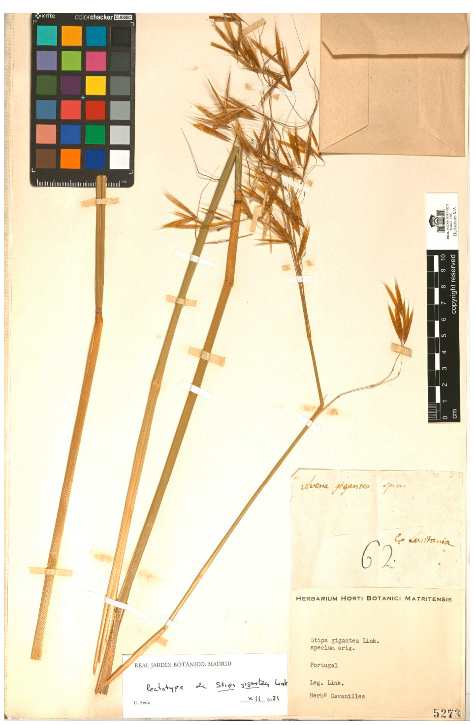
Figure 4. Lectotype of Stipa gigantea Link, in the Herbarium MA (MA00005273).

which contains a fragment with a well-developed inflorescence and allows us to unequivocally appreciate the distinctive characters of the species [63].