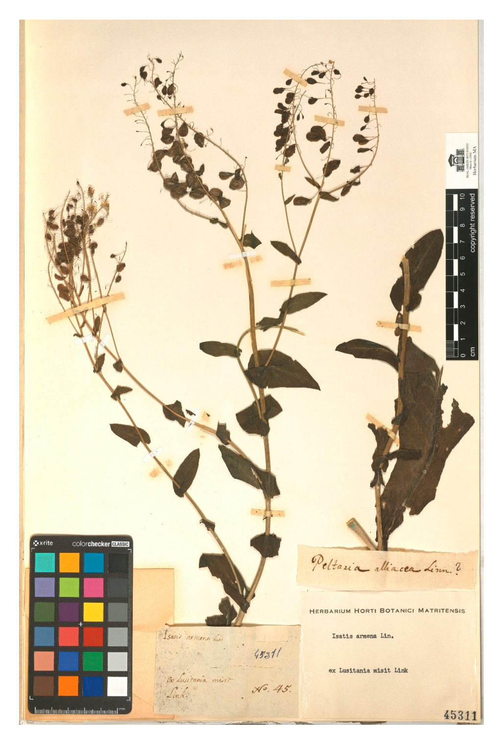
Figure 3. Specimen of Isatis platyloba Hoffmanns. ex Steud., sent by Hoffmannsegg to Cavanilles in 27 April 1801 (MA00045311).

10. Silene micrantha Link ex Otth in DC., Prodr. 1: 372 (1824). [≡Silene micropetala Lag., Varied. Ci. 2(4): 213 (1805)]. A. Otth describes in Candolle [59] the species as "Link Cav. herb./in Lusitania". In the letter sent by Link to Cavanilles in January 1799 [50] it reads "N. 70. Silene micrantha nob.", but no locality is indicated. On the label of MA00031016, which bears the number "70" handwritten by Link, Cavanilles notes "Silene micrantha Link/e Lusitania". When Lagasca [60] describes S. micropetala he does not indicate any locality nor does he mention the epithet micrantha. Later, in Lagasca [61] (p. 15) when he refers to his S. micropetala again, he specifically mentions