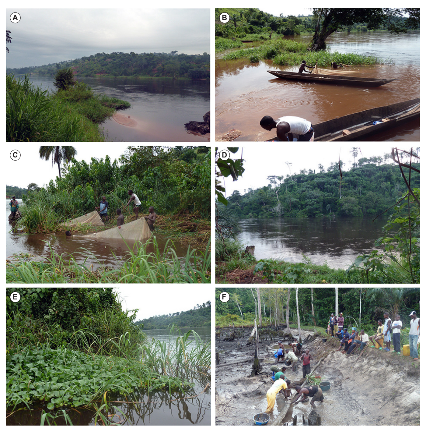
FIGURE 3. Localities and fishing techniques: A) view at Suka Ntima; B) Use of seine at Mbuji; C) Sambwisa use at Suka Ntima; D) view of Carrefour; E) Eichhornia near Mbuji; F) Collecting fish in drained pond at Carrefour.