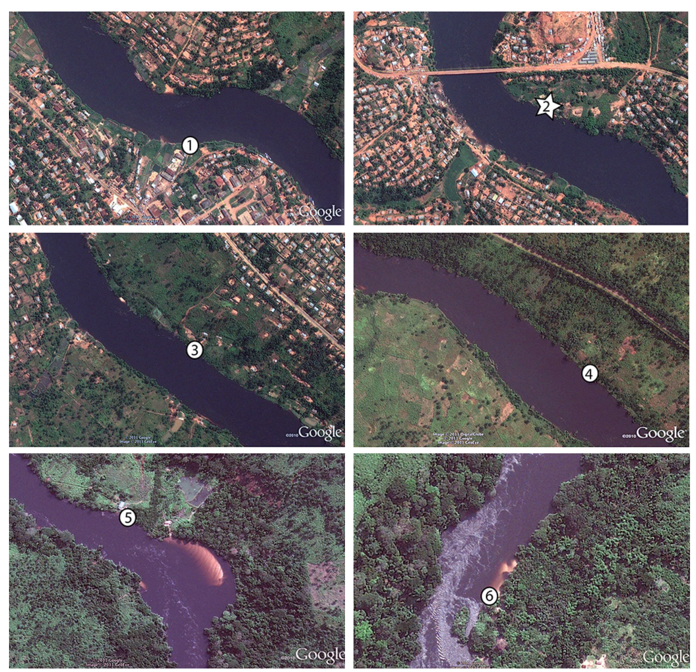
FIGURE 2. Site locations derived from Google Earth projections. Site 1, Kwilu Port; Site 2, Kwilu Beach (fish landing); Site 3, Suka Ntima; Site 4, Mbuji; Site 5, Carrefour; Site 6 Ibanzi.

Lowenstein et al. (2011) highlight the problems associated with compiling species inventories in the absence of up-to-date taxonomic and distributional knowledge of African fishes, a problem particularly acute in the central Congo basin. We acknowledge that insufficient taxonomic research has been conducted on much of the region's ichthyofauna and that some identifications to species presented here should be considered tentative, but nonetheless represent the best data available for the region.