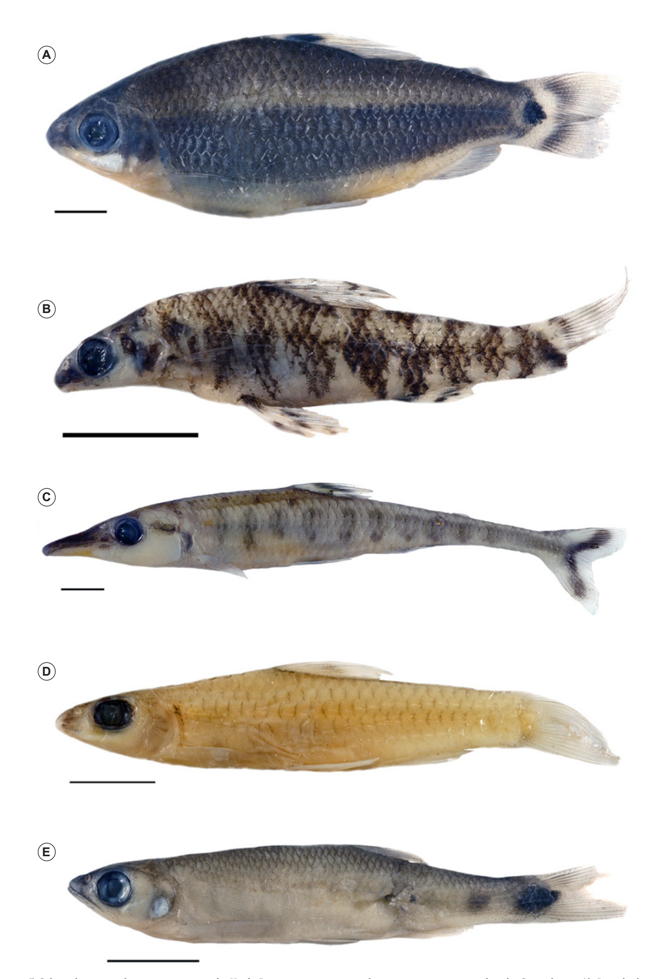
FIGURE 5. Selected species whose occurrence in the Kwilu River represents a significant range extension within the Congo basin: A) Distichodus teugelsi, B) Nannocharax schoutedeni, C) Phago intermedius, D) Barbus matthesi, E) Opsaridium maculicauda.