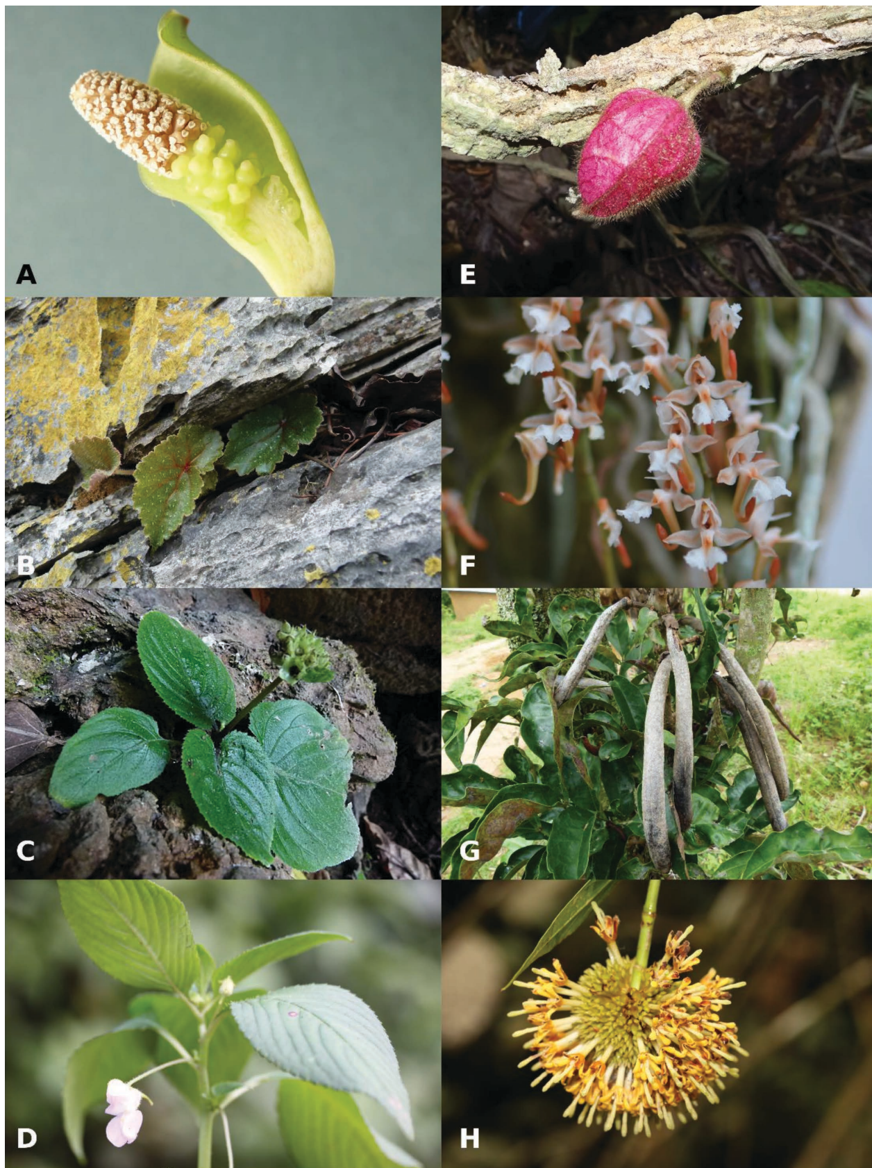
Figure 2 – Selected species. A. Anubias gillettii. B. Begonia johnstonii. C. Epithema tenue. D. Impatiens burtonii var. burtonii. E. Mendoncia phytocrenoides. F. Microcoelia macrorhynchia. G. Newbouldia laevis. H. Uncaria africana subsp. africana.