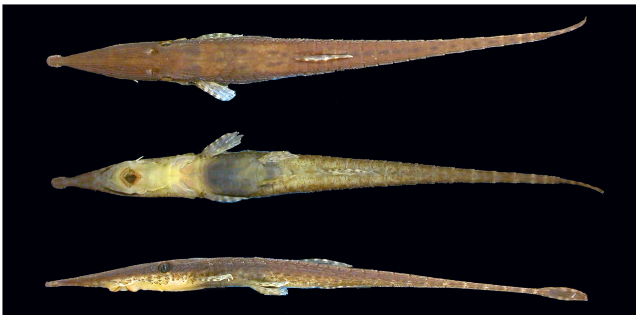
Fig. 1. Acestridium triplax , MPEG 13355, holotype, 55.5 mm SL, female, Igarapé Mutum, Juruti, Amazonas river Basin, Pará, Brazil.

Profile of head triangular with round spatulate projection on tip of snout in dorsal view. Spatulate projection covered by pair of rostral plates with large odontodes. Eyes placed laterodorsally, not visible from below; iris operculum present. Snout tip with small naked area (seen in cleared and stained specimens). One rostral plate and two postrostral plates on each side. Postrostral plates and cheek plate bent ventrally and visible in ventral view, cheek plate with canal from fifth infraorbital. Posterior portion of postrostral plates not united at midline ventrally. Mouth rounded, with globular papillae on both upper and lower lips. Oral disc width between 12.9-18.7% of postdorsal length (mean=15.8). Maxillary barbel shorter than eye diameter. Premaxilla with 22 to 30 (mean=26, n=31) bilobed teeth in