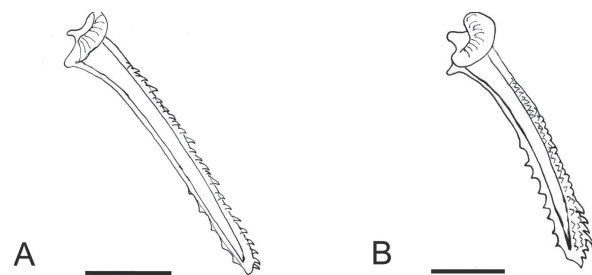
Fig. 3. Pectoral spine. A. Acestridium triplax ; B. Acestridium dichromum . Scale: 1 mm.