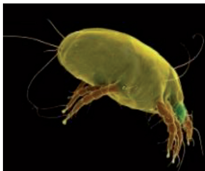
Figure 3. Dermatophagoides pteronyssinus .

The life cycle of D. pteronyssinus has been studied at 25°C and 80% relative humidity. Observations made on freshly laid eggs until they develop into adults and periods between different stages are recorded. The life cycle of D. pteronyssinus consists of five stages: egg, larva, protonymph, tritonymph and adult. Adult females lay up to 40–80 eggs singly or in small groups of 3–5. After eggs hatch, a six-legged larva emerges and after two nymphal stages occur, an eight-legged nymph appears. The life cycle from egg to adult is about 1 month with the adult living an additional 1–3 months. The average life cycle for a house dust mite is 65–100 days. A mated female house dust mite can last up to 70 days, laying 60–100 eggs in the last 5 weeks of her life. The eggs required an average of 11.26 days to develop into adults.