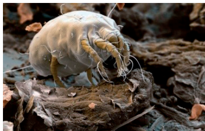
Figure 2. Dermatophagoides farinae .

Studies of the life cycle of cultured D. farinae found that after initial mating, D. farinae females lived for 63.3 days after their egg production period ended. The long period after cessation of egg production for D. farinae suggested that D. farinae females could mate multiple times and produce eggs continuously for a longer period. This study revealed that D. farinae females are capable of more than one successful mating that results in an increased egg production than that of a single mating. Females actively attract males during the reproductive period, but not