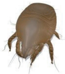
Figure 6. Euroglyphus maynei .

The reproductive biology of house dust mite E. maynei is not studied well. This mite is generally less common than D. pteronyssinus and D. farinae in homes. While it is present, it commonly coinhabits with species of Dermatophagoides and in geographic distribution, is more restricted. The period of life cycle (egg to adult) for E. maynei at 75% relative humidity as well as 23 and 30°C and fecundity at 75% RH and 23°C have been concluded, and data compared similar to data for D. pteronyssinus and D. farinae . Adults hatched from eggs at 23°C after 28 days and at 30°C in 20 days. At 23°C, females during a reproductive period of 24 days produced 1.4 eggs/day. At 23°C, mite E. maynei has a smaller life cycle than D. pteronyssinus and D. farinae ; however, at 30°C, this have a lengthier life cycle and produced fewer eggs than both mites [38].