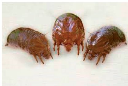
Figure 1. House dust mites.

Mites of family Tarsonemidae have modified legs IV (reduced, enlarged with a single tarsal claw on male, setiform on female); body with series of overlapping plates; and gnathosoma cone-like, enclosing minute palps and chelicerae. When mites are not as mentioned above, they may be with striated cuticle (family