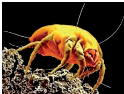
Figure 5. Dermatophagoides evansi .

Female with the distal part of the bursa copulatrix in the form of a small, oval and strongly sclerotized pocket, while male is with anal suckers ( Euroglyphus Fain), but male and female are without this combination of characters in Pyroglyphus . In Euroglyphus maynei (Cooreman), male trochanters I–III without hairs and is with a large oval anal plate spreading near to posterior edge of body, while female hairs ga, ae and those of trochanters I–III missing, and have a small posterior vulval lip that does not shelter to anterior of vulva. In case of Euroglyphus longior (Trouessart), male trochanters I–III with one hair and is with a minute hexagonal anal plate distant from posterior edge of the body. Female hairs ga, ae and those on trochanters I–III present, and posterior vulval lip is long nearly completely casing to vulva.