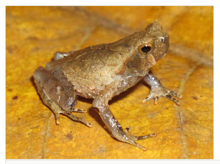
Figure 6. doi Megophrys microstoma (TBU SL.2016.419, adult male) from Son La Province, Vietnam.

Colouration in life. Dorsum greyish or light brown, upper surface of limbs with transverse dark brown bars; flanks with some small black spots; ventral surface cream with dark brown marbling (Fig. 6).