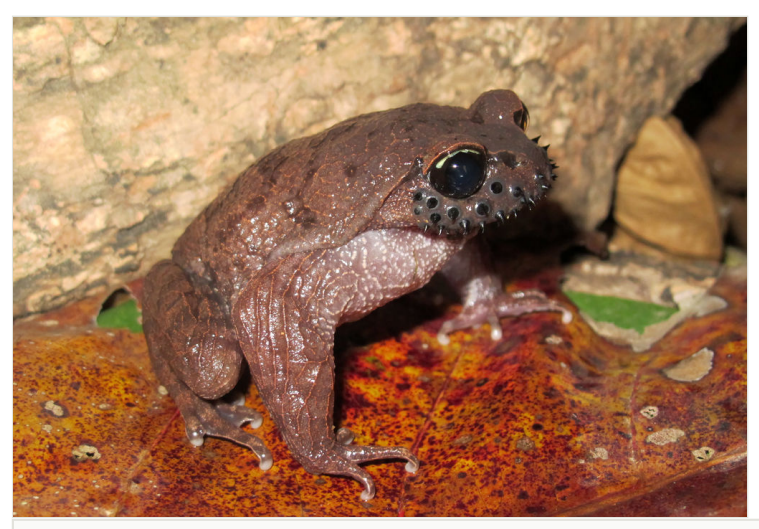
Figure 2. doi Leptobrachium ailaonicum (TBU ML.2017.9, adult male) from Son La Province, Vietnam.

Colouration in life. Dorsal surface of the head light brown or reddish-brown, with dark brown spots on medial side of upper eyelid; back with irregularly dark brown spots; ventral surface with light brown pustules, more concentrated in chest area (Fig. 2).