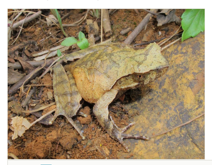
Megophrys jingdongensis (TBU ML.2017.9, adult female) from Son La Province, Vietnam.

Colouration in life. Dorsal surface brown to light yellowish-brown; a darker brown triangular marking with a yellow central blotch between eyes; chin, chest and anterior part of belly dark brown in males or light brown with erratic dark brown blotches in females, a round white spot on each side of the chest present; posterior part of belly and ventral surface of thighs cream to dirty white; posterior part of thighs dark brown with some light blotches (Fig. 5).