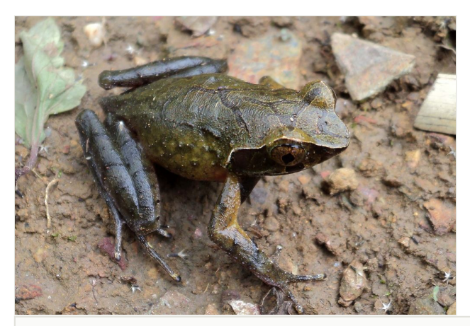
Figure 7. doi Megophrys parva (TBU PAE.705, adult male) from Son La Province, Vietnam.

Colouration in life. Dorsal surface light yellowish-brown; a darker brown triangular marking between eyes; upper lips with vertical dark brown bars; ventral surface whitish, a round white spot on each side of the chest present; ventral surface of limbs reddish (Fig. 7).