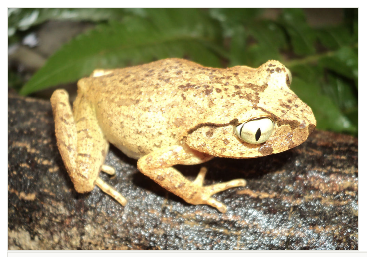
Figure 3. doi Leptobrachella sungi (TBU MD.2015.116, adult female) from Son La Province, Vietnam.

Colouration in life. Dorsal surface of head brown grey with a dark brown marking between eyes; canthus and supratympanic fold dark brown; upper lip with dark brown bars; limbs with dark brown transverse bars; ventral surface orange (Fig. 3).