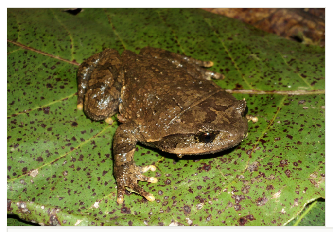
Figure 4. doi Megophrys feae (TBU MD.2015.174, adult male) from Son La Province, Vietnam.