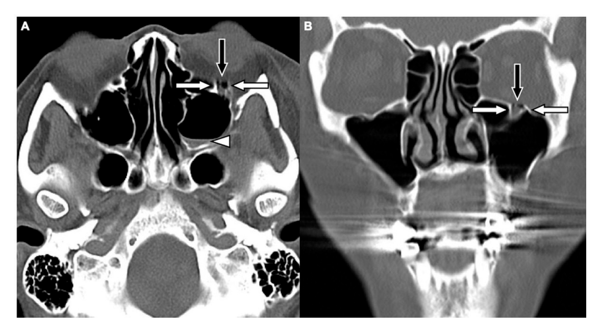
Figure 1. CT images of a 29-year-old male with assault-related head trauma and a concomitant left orbital floor fracture (OFF). An axial head CT image ( A ) and the corresponding coronal facial CT image ( B ) show gas bubbles (black arrow) entrapped between the discontinuous floor fragments (white arrows). Left type 2 maxillary hemosinus (MHS) (arrowhead) and a left zygomatic fracture are also noted in (A).

opacity at the dependent portion of the maxillary sinus measuring \geq 45 Hounsfield units (HU) as the lower limit of attenuation for clotted blood [15]. Since MHS is a relevant indicator used to detect OFFs on CT scans [5,16], we further classified MHS into the following three CT subtypes: (1) Type 1, high-attenuation opacity mixed with mottled gas (Figure 3A); (2) Type 2, air–fluid level (Figure 3B); and (3) Type 3, full opacification of the sinus (Figure 3C).