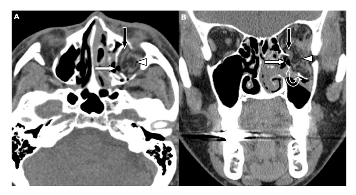
Figure 2. CT images of a 62-year-old female with motorcycle crash-related head trauma and a concomitant left OFF. An axial head CT image ( A ) and the corresponding coronal facial CT image ( B ) show inferior extraconal emphysema (straight white arrow) beneath the inferior rectus muscle (black arrow), orbital fat herniation into the maxillary sinus (arrowhead), and the depressed fragments of fractured orbital floor (open curved arrow).