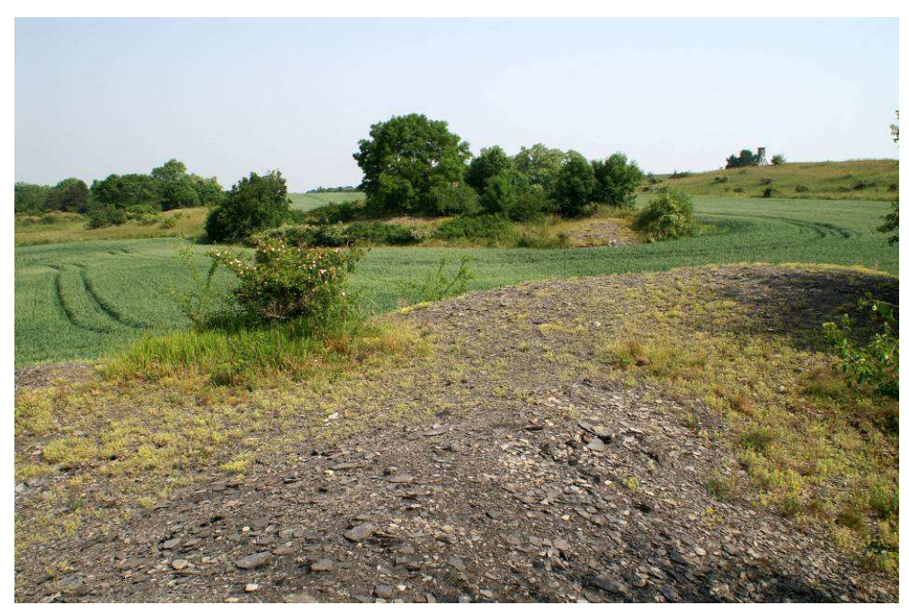
Fig. 4. Spoil heaps of the medieval copper shale mining as secondary metalliferous sites in Central Germany (Dobis, photograph: H. Baumbach, May 2008).

The post-mining landscape consists (state March 2011): in the Mansfeld mining district of 1028 small and 56 large spoil heaps (of which 8 and 12 are slag heaps, respectively), and in the Sangerhausen mining district of 416 small and 9 large spoil heaps (of which 3 and 1 are slag heaps, respectively). Thereby it has to be considered that 60-70 % of the small spoil heaps in the Mansfeld mining district were already destroyed by land burial between 1850 and 1910 (Oertel, 2002). Due to the large amount of metalliferous sites originating in the former copper-mining activities the federal state of Saxony-Anhalt has a particular responsibility towards the preservation of the habitat type 6130. Therefore, three Natura 2000 sites with the habitat type 6130 as the main conservation objective, located in the post-mining landscape of the old mines, have been designated (Tab. 3). The total size of these sites is about 687 ha. From this area 137 hectares (19.9 %) are copper-shale spoil heaps with only 21.8 hectares (3.2 %) of calaminarian grassland. Unfortunately, a comprehensive conservation strategy for these sites is not available to date.