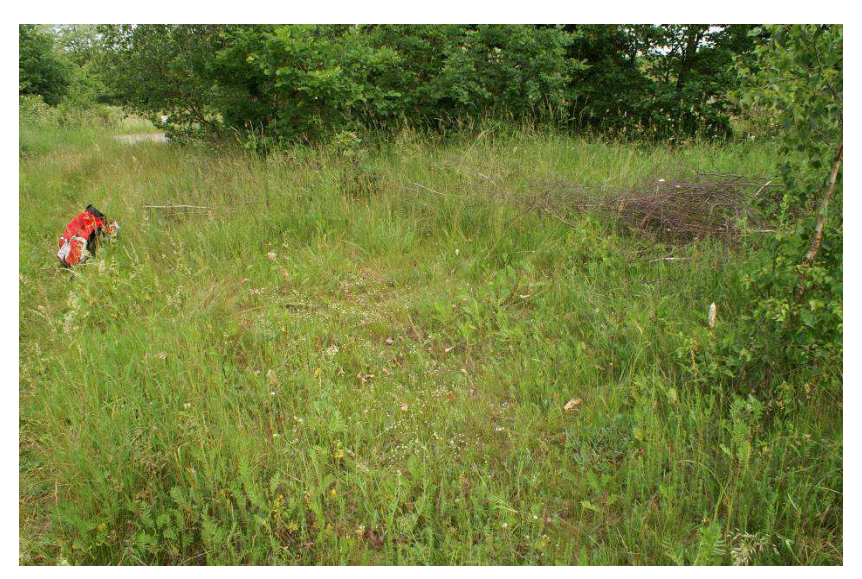
Fig. 5. Primary metalliferous site near Blankenheim (Saxony-Anhalt, Central Germany). This small site is critically endangered by shading and litter input from the surrounding grassland (photograph: H. Baumbach, June 2006).

A third site, located in the east of the village of Blankenheim, was accidentally discovered in 1999 (Fig. 5). The site is subdivided into 5 subareas with a size of only some square metres each (Tab. 4). The soil layer is only 25 cm thick and covers an outcrop of metalliferous sandore. Obviously this site was never disturbed by mining activities because sand-ores were not suitable for smelting. Furthermore, this site is located outside the former active mining area. To date this very small site has no conservational state. It is critically endangered by shading and litter input from the surrounding grassland (Arrhenatheretum) and by accidental destruction. The genotypes of the Minuartia verna -population growing at this site have both characters of the alpine populations and characters of the spoil heap populations (Baumbach, 2005). This indicates that the M. verna -population has survived on this site since the last ice age and is therefore a real paleo-endemic.