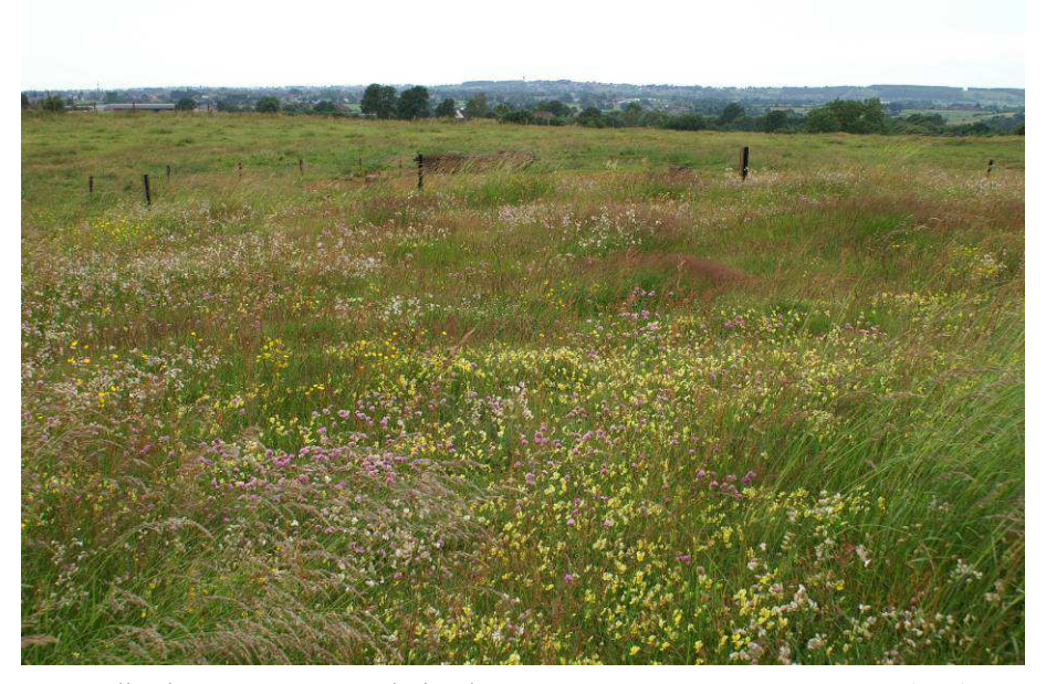
Fig. 1. Metallicolous vegetation with the character species Armeria maritima, Viola calaminaria, Minuartia verna and Silene vulgaris near Rabotrath (Belgium, photograph: H. Baumbach, June 2008).

copper-shale mining region of Mansfeld and Sangerhausen (the eastern Harz Mountains foothills region, Saxony-Anhalt, Central Germany). Despite the legal protection and several conservation efforts, the number of metalliferous soil sites with their unique flora has decreased in several regions substantially. Therefore, I want to encourage a supra-regional conservation strategy for Central European metalliferous sites.