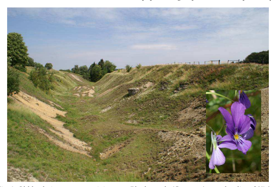
Fig. 3. Old lead-zinc opencast mining near Blankenrode (Germany), type locality of Viola guestphalica (small picture), the Westfalian zinc violet.

Cardaminopsis halleri (L.) HAYEK (Brassicaceae) is a wide-spread pseudo-metallophyte which occurs at metalliferous and non metalliferous sites (meadows, watersides, rocks). The genetic structure of 28 metallicolous and non-metalicolous populations with a total of 625 individuals was studied by Pauwels et al. (2005) using PCR-RFLP on chloroplast DNA (cpDNA). Eleven distinct chlorotypes were found: five were common to non-metallicolous and metallicolous populations, whereas six were only observed in one edaphic type (five in non-metallicolous and one in metallicolous). No difference in chlorotype diversity between edaphic types was detected. Computed on the basis of chlorotype frequencies, the level of population differentiation was high but remained the same when taking into account levels of molecular divergence between chlorotypes. Isolation by distance was largely responsible for population differentiation. As it was the case in Silene vulgaris (Baumbach, 2005) geographically isolated groups of metallicolous populations were more genetically related to their closest non-metallicolous populations than to each other. These results suggest that metallicolous populations have been established separately from distinct non-metallicolous populations without suffering founding events and that the evolution towards increased tolerance observed in the distinct metallicolous population groups occurred independently.