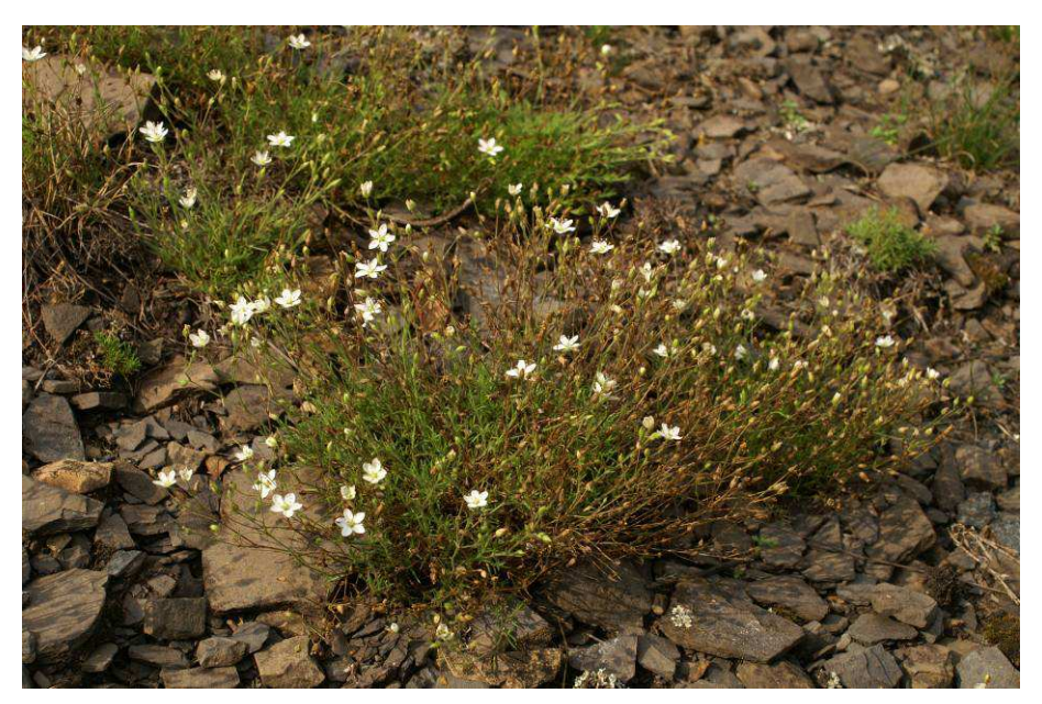
Fig. 2. Minuartia verna , one of the character species of metallicolous vegetation in Central Europe, is critically endangered in some regions due to the loss of habitats (photograph: H. Baumbach).

Minuartia verna is one of the central European character species of metalliferous soil sites that has been considered as glacial relic and therefore paleo-endemics (Schulz, 1912; Schubert, 1954a; Heimans, 1961; Ernst, 1974). Due to the large morphological variation within the Minuartia verna-complex several of the described subspecies and varieties (e. g. Graebner, 1919, Hayek, 1922; Mattfeld, 1922; Halliday, 1964) can only be delineated bio-geographically or edaphically. The necessity of a critical revision of the Minuartia verna-complex has already been postulated by Ernst (1974), nevertheless this revision still is lacking.