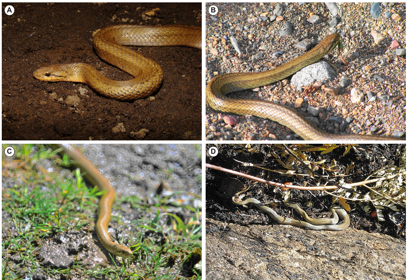
FIGURE 2. Selected specimens of Tachymenis chilensis chilensis photographed in Argentina: (a) Lago Moquehue, Neuquén, Photo by B. Blotto. (b) Parque Nacional Lago Puelo, Inicio Senda al Mirador, La Playita, Chubut, Photo by N. Vallejo. (c) Laguna del Plesiosaurio, El Pedregoso, Chubut, Photo by F. Vidoz. (d) Parque Nacional Lago Puelo, Loma de La Vega de El Turbio, Chubut, Photo by F. Vidoz.