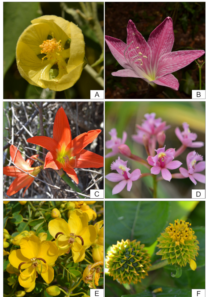
FIGURE 5. Some species of the Cagarras Islands Natural Monument; A) Abutilon esculentum ; B) Hypeastrum reticulatum ; C) Hypeastrum strictum ; D) Epidendrum reticulatum ; E) Senna pendula ; F) Tilesia baccata . (Photographs F. Moraes).