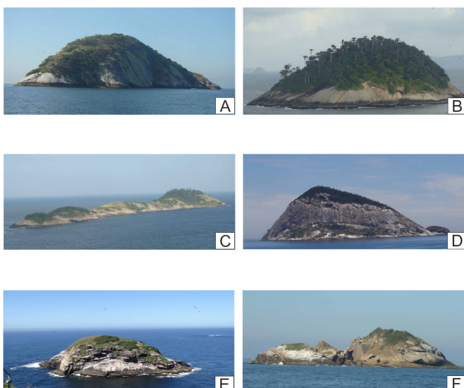
FIGURE 2. CINM, RJ, Brazil; A) Cagarra Island; B) Palmas Island; C) Comprida Island; D) Redonda Island; E) Filhote da Redonda Island; F) Filhote da Cagarra Island (Photographs: M.G.Bovini).