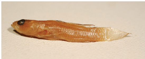
Fig. 11: Odondebuena balearica , PMR VP4399, male, 16.9+4.6 mm, off Qawra point, Malta.

dal fin damaged, off east Comino, Comino, 36.01733° N, 14.38483° E, coll. Patrick J. Schembri, 7 April 1998; PMR VP4432, juvenile of unidentified sex, 11.2+3.0 mm, off St. Paul's Islands, Malta, 35.97693N, 14.42405° E, coll. Joseph A. Borg, April 2003; PMR VP4433, female, 13.3+3.9 mm, off Zonqor Point, Malta, 35.90917° N, 14.70518° E, coll. Joseph A. Borg, June 2010; PMR VP4434, female, 17.9+4.7 mm and two males, 18.2 mm standard length, caudal fin damaged and 13.9+4.2 mm, off Zonqor Point, Malta, 35.90917° N, 14.70518° E, coll. Joseph A. Borg, June 2008; PMR VP4435, female, 13.9 mm standard length, caudal fin damaged, off Zonqor Point, Malta, 35.89445° N, 14.70677° E, coll. Joseph A. Borg, June 2008; PMR VP4436, male, 13.8+4.4 mm, off Zonqor Point, Malta, 35.892° N, 14.66833° E, coll. Joseph A. Borg, June 2010; PMR VP4437, juvenile of unidentified sex, 12.6+3.6 mm, off St. Paul's Islands, Malta, 35.97693° N, 14.42405° E, coll. Joseph A. Borg, November 2000.