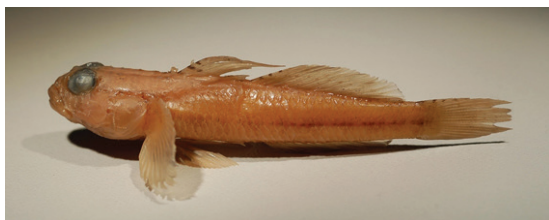
Fig. 9: Gobius roulei , PMR VP4378, male, 47.7+11.1 mm, off St. Paul's Islands, Malta.

Remarks. The present report represents the southernmost record of this species in the central Mediterranean. It is otherwise known from off the south-west coast of Portugal in the Atlantic, along the north Mediterranean coasts, and from Cyprus in the Levant (Liu et al. , 2009).