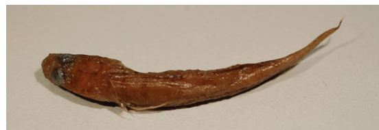
Fig. 5: Chromogobius zebratus , PMR VP4376, male, 26.3+6.7 mm, Mellicha Bay, Malta.

Remarks. The present report represents the southernmost record of this species in the central Mediterranean. It is otherwise known from Cadiz Bay in the Atlantic, and along the north Mediterranean coasts to Turkey in the east (Engin & Dalgıç, 2008).