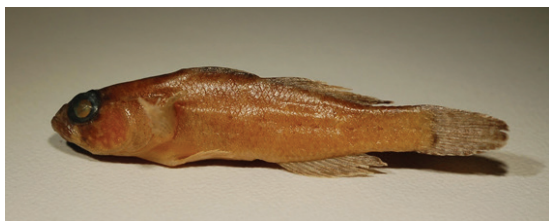
Fig. 6: Gobius ater , PMR VP4403, male, 31.7+8.1 mm, St. Thomas Bay, Malta.

Remarks. This elusive species described 130 years ago is still known from a total of only seven localities including the present records: Balearic Islands (Lozano y Rey (1919), Nice (Bellotti, 1888), Sardinia (Tortonese & Chessa (1982), Sicily (Gramito, 1993), Malta (present