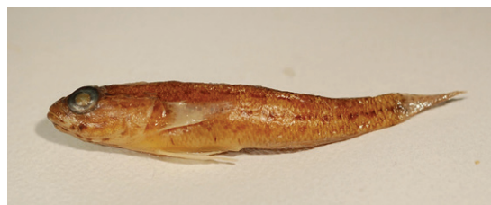
Fig. 7: Gobius fallax , PMR VP4395, juvenile of unidentified sex, 25.8+6.1 mm, St. Thomas Bay, Malta.

Remarks. The present report represents the southernmost record of this species in the central Mediterranean. It is otherwise known from the Canaries in the Atlantic, along the north Mediterranean coasts and from Cyprus in the Levant (Kovačić et al. , 2011).