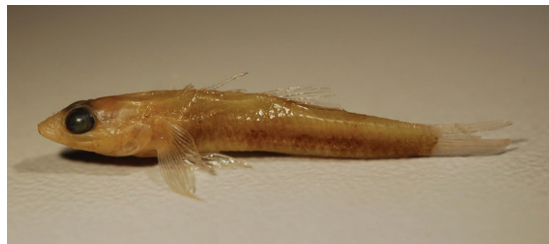
Fig. 12: Speleogobius llorisi , PMR VP4377, male, 16.1+4.4 mm, off Delimara Point, Malta.

Diagnosis. (1) suborbital papillae of lateral-line system with longitudinal row a ; (2) posterior oculoscapular head canal of lateral-line system absent; (3) preopercular head canal present with pores \gamma , \delta , \epsilon ; (4) pelvic fins united