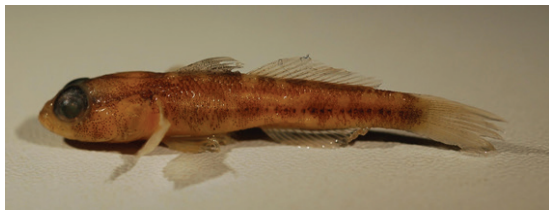
Fig. 8: Gobius gasteveni , PMR VP4373, juvenile female, 27.8+7.5 mm, off Zonqor Point, Malta.

Remarks. The present report represents the easternmost record of this species otherwise known only from the northeastern Atlantic and western Mediterranean (Ahnelt et al. , 2011).