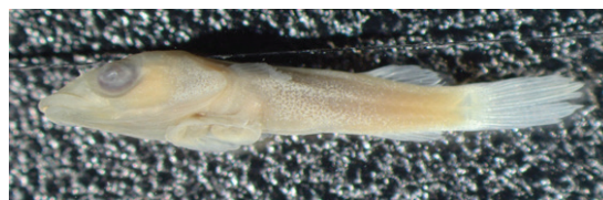
Fig. 2: Apletodon incognitus , PMR VP4421, juvenile of unidentified sex, 11.7+2.8 mm, Sikka l-Bajda off NE Malta, Malta.

Diagnosis. (1) three lachrymal canal pores; (2) three mandibular canal pores; (3) dorsal and anal fins normal, with strong rays; (4) dorsal fin rays 4-6, anal fin rays 4-6 (present material dorsal fin 4-5, anal fin 4-5); (5) no spine in subopercular region; (6) row of papillae present on central part of anterior half of sucking disc from region A to region C.