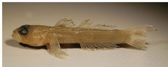
Fig. 13: Vanneaugobius dollfusi, PMR VP4386, male, 21.5+5.7 mm, off St. Paul's Islands, Malta.