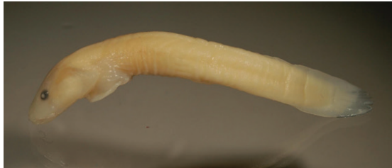
Fig. 3: Gouania wildenowi, PMR VP4374, male, 41.1+5.8 mm, Wied Il-Ghasri, Gozo, Malta.