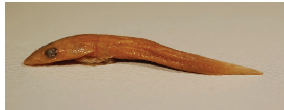
Fig. 4: Opeatogenys gracilis , PMR VP4388, male, 17.8+3.6 mm, Mellicha Bay, Malta.

Material examined. PMR VP4388, male, 17.8+3.6 mm, Mellicha Bay, Malta, 35.9759° N, 14.36612° E, August 2000 (Fig. 4); PMR VP4389, juvenile of unidentified sex, 8.8+1.9 mm, Mellicha Bay, Malta, 35.9759° N, 14.36612° E, August 2000; PMR VP4390, juvenile of unidentified sex, 9.9+2.5 mm, Mellicha Bay, Malta, 35.9759° N, 14.36612° E, August 1999; PMR VP4391, juvenile of unidentified sex, 9.8+2.3 mm, Mellicha Bay, Malta, 35.9759° N, 14.36612° E, August 1999; PMR VP4392, male, 10.9 mm standard length, caudal fin damaged, White Rocks, Malta, 35.93895° N, 14.46538° E, August 1999; PMR VP4393, male, 18.3+3.8 mm, White Rocks, Malta,