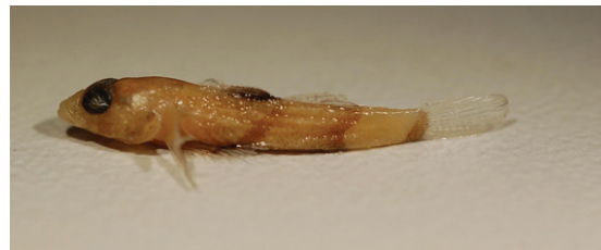
Fig. 10: Lebetus guilleti , PMR VP4383, female, 11.6+3.3 mm, off St. Paul's Islands, Malta.

Remarks. The present report represents the southernmost record of this species in the Mediterranean. The species is known from the North-Eastern Atlantic and from four Mediterranean records along the north Mediterranean coasts (Engin et al. , 2015).