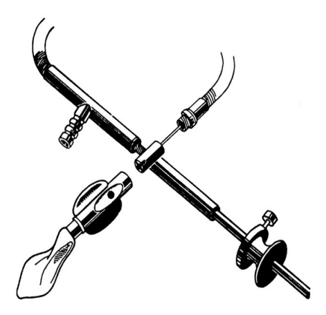
Figure 7. Margot Shiner's jejunal biopsy tube.<sup>34</sup>

The introduction of intestinal biopsy was instrumental in confirming the diagnosis of celiac disease, it highlighted the characteristic flattening of the mucosa when exposed to gluten. This finding was defined by Paulley in 1954, by means of laparotomy-obtained samples from adult individuals affected by idiopathic steatorrhea.<sup>31</sup> The difficulty in obtaining samples able to yield data suggested the need for a viable method to obtain intestinal biopsies from these patients. Wood et al. designed in Melbourne a simple biopsy tube which was flexible and could be used to perform gastric biopsies without the aid of a gastroscope or an X-ray screen; it was soon was used to establish the histological diagnosis of diffuse lesions such as chronic gastritis or atrophic gastritis.<sup>32</sup> Marcelo Royer et al. in Buenos Aires<sup>33</sup>, and Margot Shiner, in London<sup>34</sup>, each developed separately a technique for peroral duodenal biopsy under fluoroscopic control, based on a device designed by Wood (Figure 7).