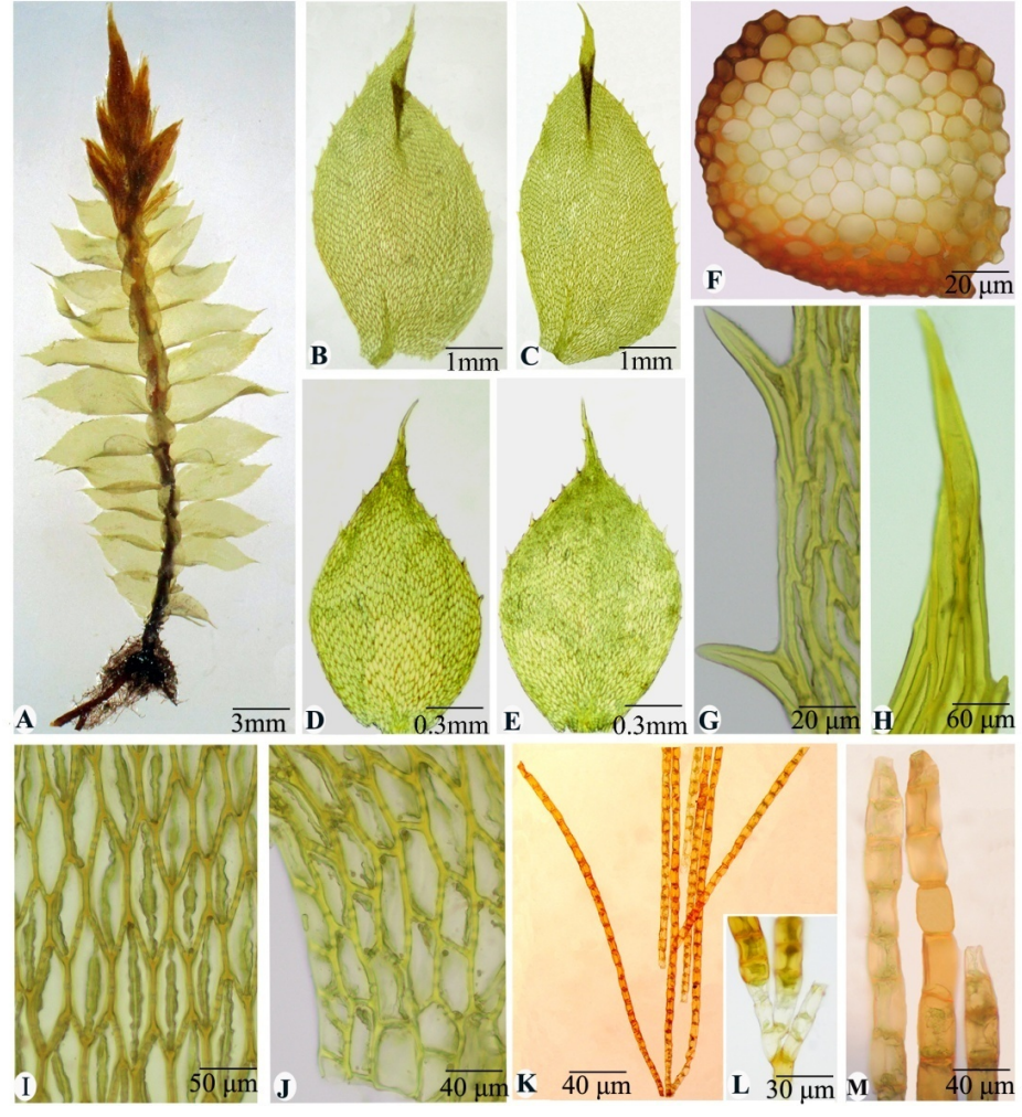
Fig. 2 (A-M). Cyathophorum hookerianum (Griff.) Mitt.