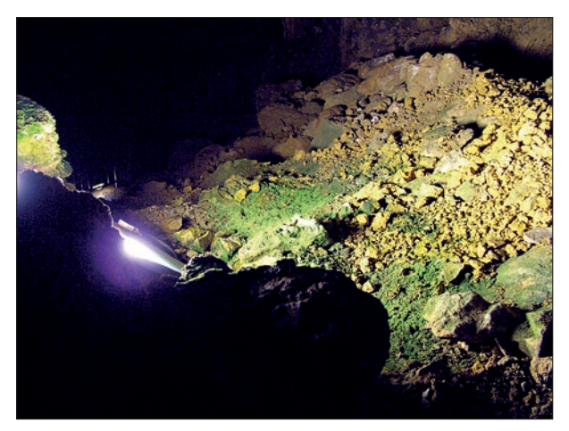
Fig. 5: Clastic deposits and clay promote the growth of large patches of mosses.

and ferns, which usually appear in later stages (Mulec & Kubešová 2010). Near various LED lamps installed along the steps of the downwards pathway, green patches of microalgae were found, but near some LEDs small, very scattered individuals of Bryum sp., Eucladium verticillatum, Fissidens bryoides, Oxyrrhynchium schleicheri, sometimes accompanied by single small shoots of Asplenium trichomanes were observed, extending up to a distance of 15 cm from the lights (Tab. 2, Fig. 3). In the artificial tunnel along the Carlo Finocchiaro path, opened to the public in 1996, lampenflora is colonizing the moist calcareous walls around almost all the fluorescent lamps, with Bryum sp., Didymodon vinealis, Eucladium verticilatum, Fissidens bryoides, Oxyrrhynchium schleicheri,