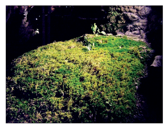
Fig. 2: A well developed lampenflora community dominated by mosses in Grotta Gigante.

As for ferns, Asplenium trichomanes is common throughout the cave; small plants are usually found around lamps, but well-developed individuals occur in highly lit sites wet by continuous dripping water. Asple nium scolopendrium in development in one site is a new record for the inner part of the cave. According to Polli and Sguazzin (1998), the species, which has been de-