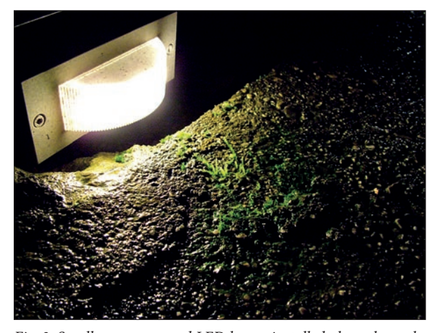
Fig. 3: Small mosses around LED lamps installed along the pathways in 2009.

As for main ecological factors influencing lampenflora in the cave, no particular zonation of bryophyte and fern vegetation was observed along decreasing light gradient around lights, as found by Mulec et al. (2008) for aerophytic algal communities in Slovenian caves. Various mosses and Asplenium trichomanes were observed growing over a relatively wide range of light intensity, in accordance with the findings by Mulec and Kubešová (2010). The poorly lit, most distant areas from lamps are characterized by the constant occurrence of Eucla dium verticillatum ; sometimes some reduced plants of A. trichomanes are present there as well.