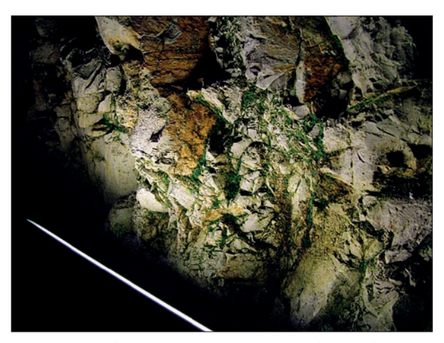
Fig. 4: Lampenflora colonizing the wet walls of an artificial tun nel around fluorescent lamps fitted in 2009.

Substrate type seems to play a minor ecological role for some species, such as Eucladium verticillatum and Asplenium trichomanes, but it influences the occurrence of others. Tortula muralis, for instance, was mainly found on the rock walls of the artificial gallery. The permanently wet, lit surfaces of cave speleothems are dominated by E. verticillatum and avoided by other mosses: lit parts of the main stalagmites of the show cave, the "Palma" and the "Colonna Ruggero", are colonized by patches of this species. Fissidens bryoides thrives on clay, even if present as a thin layer on rocks and formations. Clay influences both moisture and mineral nutrient content of the substrate, promoting plant growth: in Grotta Gigante surfaces with clay support the growth of extensive patches of mosses, up to c. 4 m<sup>2</sup> wide (Fig. 5), as reported in the literature (e.g. Johnson 1980).