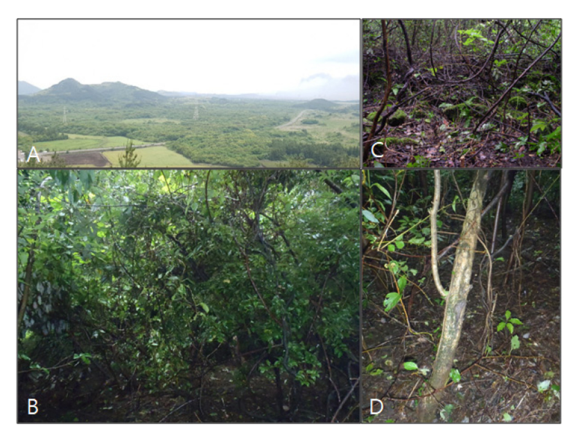
Fig. 2. Pictures showing the characteristics of the evergreen broad-leaved forest in the vicinity of Baekyaki Oreum in Gujwa-Seongsan Gotjawal, Jejudo Island. A. Panoramic view of the evergreen forest from the top of Baekyaki Oreum. B. Vegetation. C. Bryophytes on rocks. D. Bryophytes on bark.

starting from Yongnuni Oreum and ending near Jimibong Oreum. Finally, the Susan Gotjawal lava flow starts around the vicinity of Gungdaeak Oreum 50 m above sea level in the western area of the village of Susan-ri, running for more than 5.5 km (Song, 2000). However, Ahn et al. (2015) found that Gujwa-Seongsan Gotjawal was formed by four sequential eruptions at Donggeomun Oreum. The lava flows from the first eruption are distributed in parts of Jongdal-Handong Gotjawal, Sangdo-Hado Gotjawal, and Sehwa Gotjawal. The second flows are distributed along the direction of Sangdo-