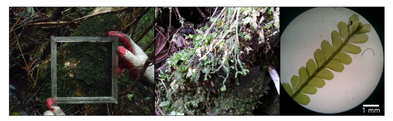
Fig. 3. Plagiochila shangaica Steph. found in the study area.