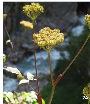
Images 13–24. Threatened Flora of Uttarakhand: 13— Trollius acaulis | 14— Butea pellita | 15— Uraria picta | 16— Eutrema purii | 17— Eremogone curvifolia | 18— Kuefferia infelix | 19— Kashmiria himalaica | 20— Pinguicula alpine | 21— Saussurea atkinsonii | 22— Nardostachys jatamansi | 23— Panax pseudoginseng | 24— Angelica glauca .