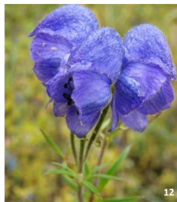
Images 1–12. Threatened flora of Uttarakhand: 1— Dioscorea deltoidea | 2— Fritillaria cirrhosa | 3— Cypripedium himalaicum | 4— Oreorchis micrantha | 5— Pecteilis gigantea | 6— Asparagus filicinus | 7— Polygonatum graminifolium | 8— Trachycarpus takil | 9— Papaver robustum | 10— Berberis osmastonii | 11— Aconitum lethale | 12— Aconitum violaceum .