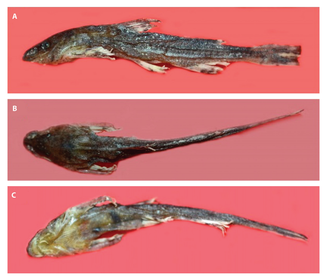
Fig. 2. Glyptothorax telchitta (a) lateral view (b) dorsal view (c) ventral view.