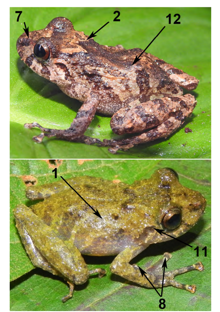
Figure 1. Pristimantis ockendeni, Madidi National Park. Annotated numbers correspond to those featured in the description.

As part of the Identidad Madidi initiative (http://www.identidadmadidi.org), in June 2015 we conducted a biodiversity survey in montane savanna and gallery forests along the Machariapo River and near the community of