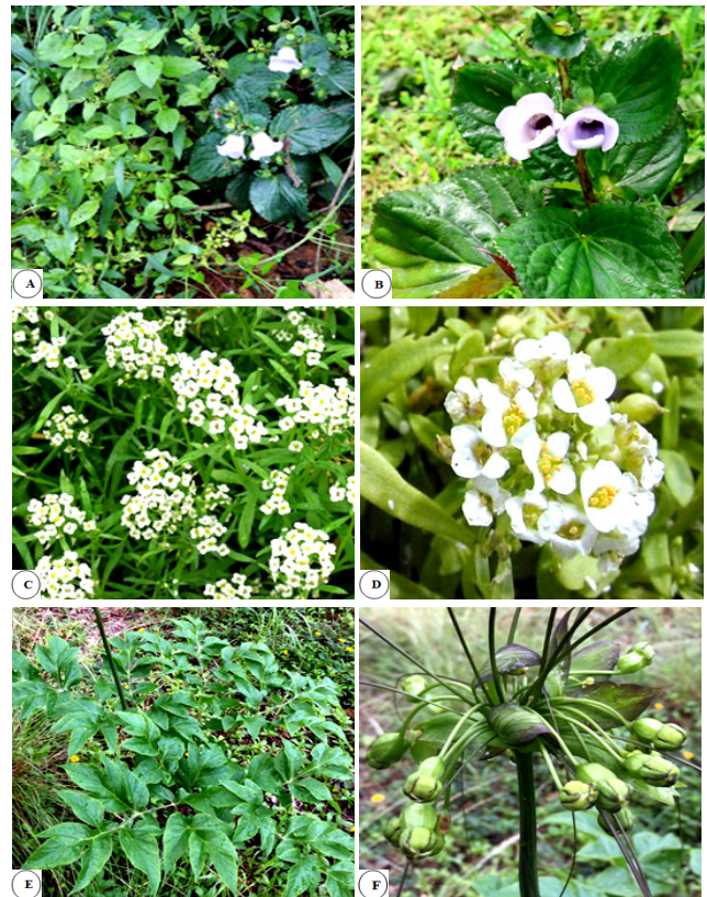
Plate 2: 2A: Gloxinia perrenis with its associated species; 2B: A single flowering twig of G. perrenis ; 2C: Flowering bunch of Lobularia maritime ; 2D: A single inflorescence of L. maritime ; 2E: Individual plant of Tacca leontopetaloides ; 2F: Fruiting branch and fruits of T. leontopetaloides .