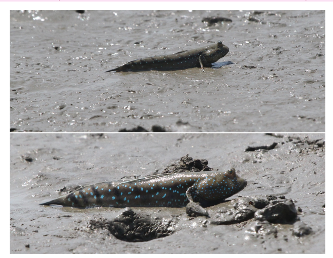
Image 1. Blue-spotted Mudskipper Boleophthalmus boddarti.

saplings gives a better habitat for various species, and it was observed that large-sized mudskippers were found in the breakwater (sheltered area for mangroves) (Hashim et al. 2010). Pseudapocryptes elongatus is able to tolerate the salinity, and hence it survives in the open sea, coastal mangroves and inland habitat during different stages of their growth (Bucholtz et al. 2009). Mudskippers alter the environmental conditions improving the growth of young mangroves as they mix the soil with detritus (Ravi et al. 2013). Studies related to the microhabitat selection of Chinese mudskippers identified their preferences, such as salinity levels, land or water; water and air temperatures; light or dark; and various combinations among them were conveyed (Gordon et al. 1985). The major threats to the mudflats are soil erosion, macro algae, terrestrialization, and lack of estuarine water, human interference, and discharge of effluents (Ravi 2012). Periophthalmodon septemradiatus species is found to be the first species inhabiting and breeding from a saline environment to a