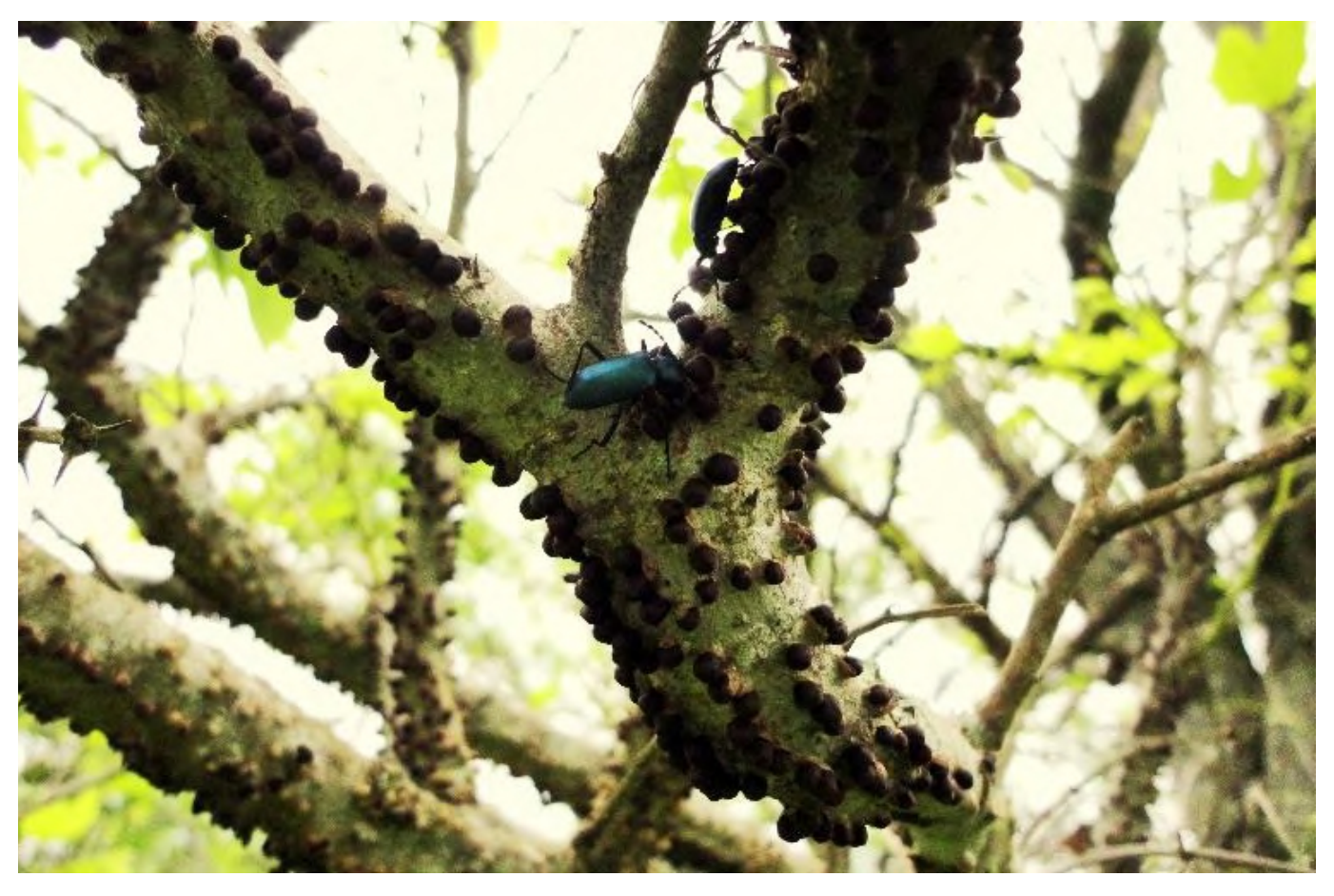
Figure 3. Beetles visiting the flowers of Pilostyles , perhaps nourishing of the nectar produced on the nectaries.