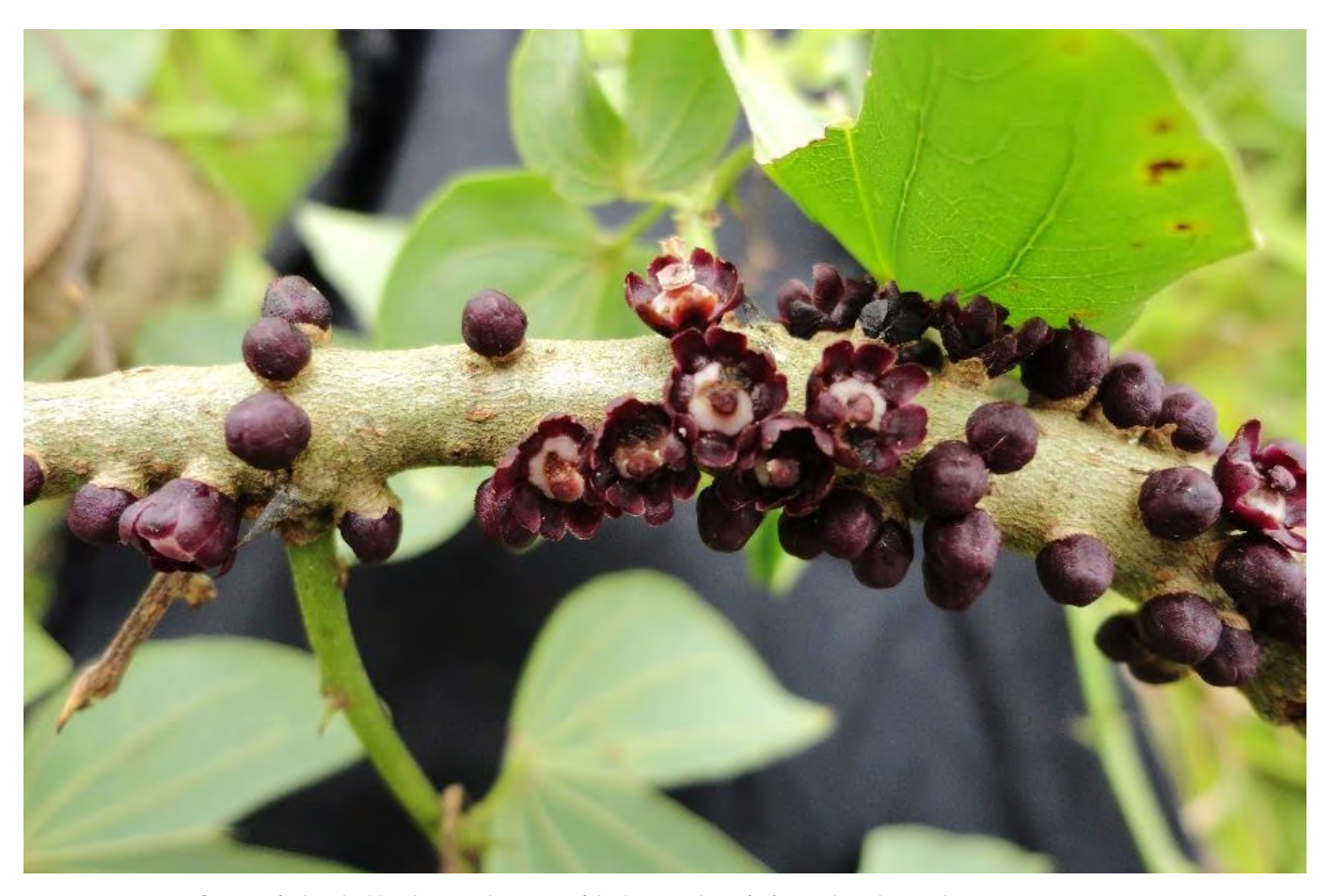
Figure 2. Staminate flowers of Pilostyles blanchetti on the stems of the host Bauhinia forficata .