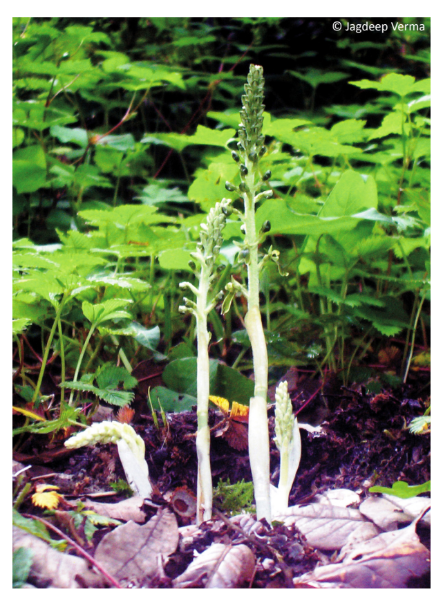
Image 1. Neottia listeroides Lindl. Plants growing in Oak-pine forest at Churdhar.

Threats and Conservation: A large proportion of orchid habitats (forests/ grasslands) in Himachal Pradesh have lost their quality due to expanded agricultural and other developmental activities. Large scale exploitation of forests for tourism related activities has detrimentally affected the delicately balanced ecological equilibrium; even littering and trampling are enough to impair the habitats. This species is vulnerable to frequent land slips, grazing, and fodder and fuel wood collection activities. The orchids are inherently slow growers and due to their nutritional complexities (which are relatively more complex in leafless species) they germinate poorly in nature. In N. listeroides , though the green flowers and young stems help plants in performing photosynthesis,