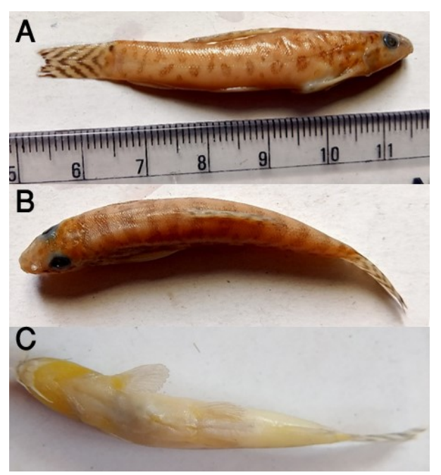
FIGURE 1 Paracanthocobitis botia . A, lateral view; B, dorsal view; C, ventral view.

Morphological view (Figure 1): Body elongates, dorsal profile rising evenly from tip of the snout to head, slowly increasing from head to origin dorsal-fin, then decreasing gently towards caudal peduncle. Body cylindrical anterior-ly to origin of dorsal-fin then compressed posteriorly. Head slightly depressed, snout rounded, eyes large, near top of head, slightly nearer to tip of snout than end of operculum.