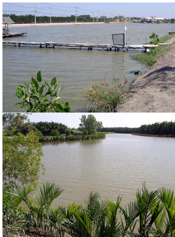
Figure 2. Adjacent water bodies in the lower Chao Phraya River delta, Thailand, found to be inhabited by " Cichlasoma " urophthalmus . Photographs by Leo G. Nico (13 Nov 2006)

The Chao Phraya basin drains about 160,000 km 2 or nearly one-third of Thailand's land area. Its delta, one of the largest in Southeast Asia (about 40,000 km 2 ), is on the Gulf of Thailand (Molle and Srijantr 2003, Szuster 2003). The deltaic plain is low lying, with little relief and a tropical wet savannah climate. The lower delta region has been highly modified by humans, with much of the floodplain's water compartmentalized by low artificial levees. In combination with other modifications, the result has been the creation of a mosaic of aquatic habitats consisting of numerous small and large ponds or reservoirs, small and large ditches, and numerous canals. Most aquatic habitats are interconnected and water can be easily transferred into different sub-basins during periods of exceptionally high or low flows. Extensive shrimp and fish farming are practiced throughout the delta (Szuster 2003; B. Szuster, personal communication).