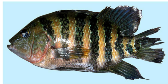
Figure 4. “ Cichlasoma ” urophthalmus (143 mm SL), probably an adult, taken from the lower Chao Phraya River delta site in Thailand. This specimen shows a color pattern and body shape different from introduced Florida “ C. ” urophthalmus , but is similar to some individuals reportedly captured in their native range in Mexico. It was captured either on 13 November 2006 or shortly before but was not preserved, therefore we were unable to determine reproductive status, but body size indicates it is an adult.

We noted that “ C. ” urophthalmus specimens from the Chao Phraya delta exhibited variation in color patterns and body shapes. In particular, one of the larger specimens (143 mm SL) was slightly unusual in color pattern and shape (Figure 4). This fish may simply represent an