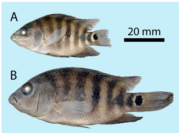
Figure 3. Preserved “ Cichlasoma ” urophthalmus (40 and 64 mm SL), part of the voucher specimen sample netted at site in lower Chao Phraya River delta on 13 November 2006. Smaller specimen (A) is missing part of caudal fin. Based on size, absence of gonadal tissue, and typical size at first maturity, these fish were both determined to be juveniles.

(still and video) a few large “ C. ” urophthalmus (estimated to be between 130 and 180 mm SL, Figure 4) and other non-native species that locals had collected prior to our arrival. All or most of the large “ C. ” urophthalmus were caught angling with hooks baited with small shrimp. Some of these cichlids were caught on 12 November 2006 and others were presumably captured during preceding days or months. These fish were being maintained live in an outdoor concrete tank and none were preserved.