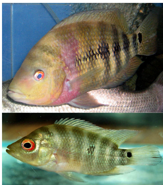
Figure 7. Examples of other non-native cichlids present in Southeast Asia that superficially resemble " Cichlasoma " urophthalmus . These are likely hybrids of " C. " trimaculatum and presumably represent varieties of the ornamental hybrid group known as Flowerhorns. Upper image shows live individuals for sale as food outside a restaurant in the Bang Rak district of Bangkok, early February 2006 (Photograph by Leo G. Nico). Lower image is a juvenile (about 80 mm TL) captured at Tasik Biru (Blue Lake), northwest Borneo, Malaysia on 24 June 2006. In addition to the one fish captured, the collector observed about 20 additional cichlids of the same type swimming in the lake. (Photograph by Michael Lo). Note the red iris of these fish, a character rare or absent in " C. " urophthalmus