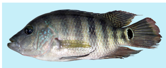
Figure 1. Specimen (>100 mm TL) identified by us as " Cichlasoma " urophthalmus . Fish was collected 26 September 2005 by Jean-Francois Helias while angling in the lower Chao Phraya River delta, Thailand.

In recent years the sport-fishing guide Jean-Francois Helias, of Fishing Adventures Thailand, has periodically sent us photographs of fishes that he and colleagues caught in Southeast Asia. Some photographs were of fishes that Mr. Helias was unable to positively identify and, among these, a few were images of non-native fishes either not previously reported or poorly documented for the region. Of particular interest were photographs sent to us in September 2005 showing a fish that we identified as the Mayan Cichlid " Cichlasoma " urophthalmus (Günther, 1862) (Figure 1). This cichlid is native to the New World tropics and introduced populations in Florida (USA) appear to be highly invasive. Mr. Helias informed us of the existence of a population in a brackish water canal system south of Bangkok in the lower Chao Phraya River delta near the Gulf of Thailand. He first became aware of its presence in 2005 when specimens began appearing in the catch of a local fisherman employed to provide live bait fish. In November 2006, responding to our desire to examine actual specimens and learn more about the wild population's status, Mr. Helias kindly agreed to guide us to the site in Thailand where the cichlid had