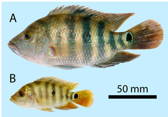
Figure 8. “ Cichlasoma ” urophthalmus netted from the Punggol River of Singapore: (A) 124 mm SL captured 27 June 2006; and (B) 66 mm SL taken 4 July 2006. These preserved specimens are deposited at the Raffles Museum of Biodiversity Research (RMBR) at the National University of Singapore. The dark spot centered on 4th bar is most evident in the smaller specimen.

“ C. ” urophthalmus is more common along the estuarine northern coast of Singapore on both sides of the causeway which links Singapore to Johor via a land bridge, possibly throughout the Johor Straits estuaries. The Punggol River is a relatively short, narrow and shallow estuary that flows into the Straits of Johor near the Singapore community of Punggol (approx. 1°22'41"N; 103°52'31"E). The river exhibits a mesohaline to polyhaline environment (Thia-Eng 1973).