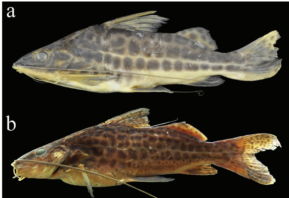
Figure 2. Lateral view of (a) Pimelodus misteriosus , NUP 10824, 160.0 mm SL, and (b) P. maculatus , NUP 12783, 214.4 mm SL, evidencing color pattern in alcohol and shape of adipose fin.

distinguished from P. ornatus , and also from P. argenteus Perugia and P. albicans (Valenciennes) (both sympatric with P. misteriosus in the lower Paraná River basin), by the spotted body (Fig. 2a) ( vs. striped in P. albicans and P. ornatus and uniformly greyish in P. argenteus ). Pimelodus brevis , until recently considered as valid in the lower Paraná River basin, has been synonymized in P. argenteus by Rocha & Pavanelli (2014).