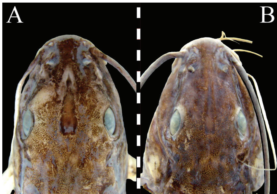
Figure 3. Dorsal view of head, evidencing interorbital distance in (a) Pimelodus misteriosus , NUP 12778, 202.5 mm SL; and (b) P. maculatus , NUP 12783, 214.4 mm SL.

fin in adult specimens ( vs. not reaching base of anal fin); (2) exposed surface of supraneural and 1 st and 2 nd dorsal pterygiophores broad ( vs. narrow); (3) anterior margin of pectoral spines with well-developed serration ( vs. poorly developed); (4) teeth present in vomer and metapterygoid in all individuals ( vs. absent from both bones in all individuals). We observed some other diagnostic characters of P. misteriosus not mentioned by Azpelicueta (1998), such as adipose fin short, deep and somewhat triangular in shape (Fig. 2a), vs. long, its depth about half its length