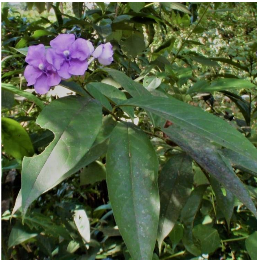
Figure 1. Brunfelsia grandiflora ssp. grandiflora in the Pakayaku rainforest, Ecuador. Photo credit: CX. Luzuriaga-Quichimbo (8 February, 2016).

Brunfelsia grandiflora (see Figure 1) is a small tree that was described by David Don in 1829 from material collected during the Ruiz and Pavon expeditions undertaken in Peru [2]. It has spread from Central America (Nicaragua, Costa Rica, USA) to the north of South America (Colombia, Brazil, Ecuador, Peru and Bolivia). There, it is well-known in cultivation as ornamental, exhibiting some exceptional forms. In the Amazon region, it is also cultivated for its narcotic and medicinal properties. It grows primarily at elevations of 650–2000 m, mainly on the eastern slopes of the Andes, in the region known as the montana (i.e., a humid, montane rainforest) [3].