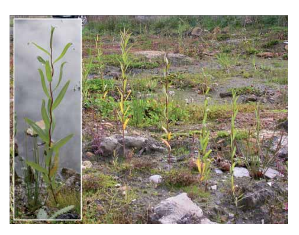
Figure 4. Saplings of S. matsudana 'Tortuosa' × S. fragilis var. fragilis at a disturbed site in Huonville. Inset: Close-up of a single sapling showing contorted stem and leaves.

means (Carr 1996). In Tasmania, it is grown as roadside plantings, in parks and large gardens, and is often planted on the banks of watercourses and water bodies in rural areas. It is rarely recorded as naturalised, most plants appear to have been planted deliberately. At one location (Emu River, Burnie Baker 248, HO), a small degree of vegetative spread, limited to a few plants, is evident but deliberate planting still cannot be ruled out. This taxon is capable of sexual reproduction, a population of small saplings were growing in a roadside drainage line in southern Tasmania (Lucaston, Baker 1745, HO). The plants had characteristic yellow stems of S. ×sepulcralis nothovar. chrysocoma. Both S. fragilis var. fragilis and S. × sepulcralis nothovar. chrysocoma were in cultivation nearby. Salix × sepulcralis nothovar. chrysocoma may have also been a parent of an infestation of plants which grew in sediment settling ponds at Launceston.