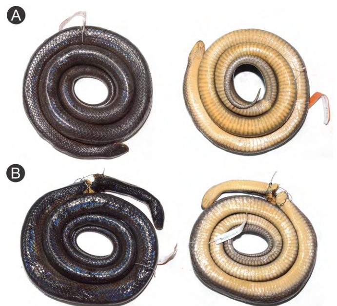
Figure 1. Dorsal and ventral views of Mussurana quimi from Universidade Federal de Santa Maria, Rio Grande do Sul, Brazil. A. ZUFMS 2533. B. ZUFMS 2511.

While examining specimens of Pseudoboini in the Herpetological Collection of Universidade Federal de Santa Maria (UFSM), Rio Grande do Sul, Brazil, we came across two unidentified individuals (ZUFMS 2511, 2533) collected on the UFSM campus (−29.7150, −53.7164; WGS 84). On