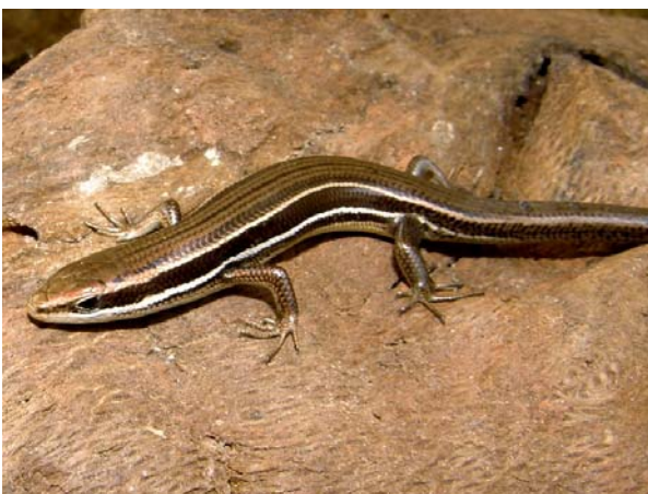
Figure 12. Mabuya dorsivittata (specimen not collected).

1. Mabuya dorsivittata Cope, 1862 (Figure 12). N = 12. With a wide distribution range, it inhabits fields with predominance of graminées in Uruguay, Paraguay, Argentina and Brazil (Peters and Donoso-Barros 1970; Recorder and Nogueira 2007). In Viçosa there are records from UFV campus (2) and old pastures in regeneration (6).