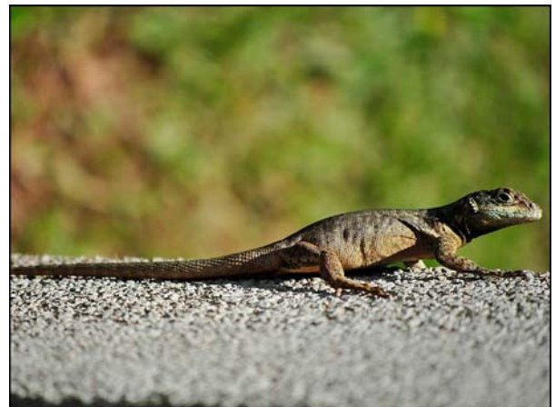
Figure 15. Tropidurus torquatus (specimen not collected).

municipalities near Viçosa have natural fragments of open fields (IEF 2007). Due to forest fragmentation along the 19th century and beginning of the 20th century (Ribon et al. 2003; Pereira 2005), it is possible that species inhabiting open formations (e. g. Mabuya dorsivittata and Tropidurus torquatus ) have dispersed from natural to anthropic fields, extending their distribution in the region. But we also do not discard the hypothesis that Viçosa had some patches of natural fields not reported in literature (where those species could naturally occur), altered by human action when the first settlers arrived.