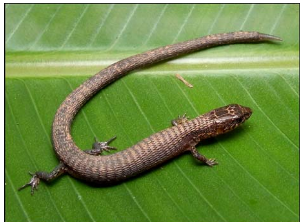
Figure 7. Eubleopis gaudichaudii (MZUFV 618 in life).

from Uzzell (1969), this small lizard occurs along the Atlantic Forest of southeastern and southern Brazil, with an additional record from state of Goiás (in central Brazil), without precise locality data (which also could be from an Atlantic Forest area, as the southern region of Goiás was originally covered by this biome [SOS Mata Atlântica and INPE 2008]). In Viçosa, E. gaudichaudii is found in secondary forest (1), old pastures in regeneration stage (9), urban area (2) and in UFV campus (2).