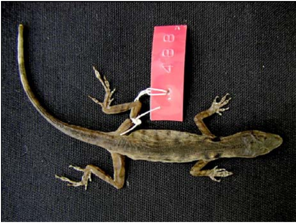
Figure 11. Anolis fuscoauratus (MZUFV 488; preserved specimen) .

In Viçosa, there is one record from a forest fragment considered primary ( mata do Seu Nico ), and other from old pastures in regeneration stage.