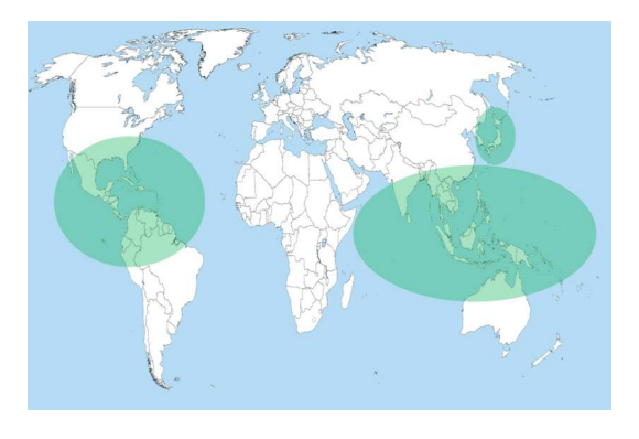
Fig. 5. Tropical Central America and indopacific distribution of genus Polymesoda