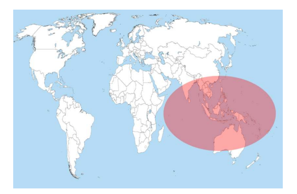
Fig. 4. Tropical indo-pacific distribution of B. violacea

[44], Mexico [27], Philippines [45-47], Singapore [26], Thailand [48] and USA [29].