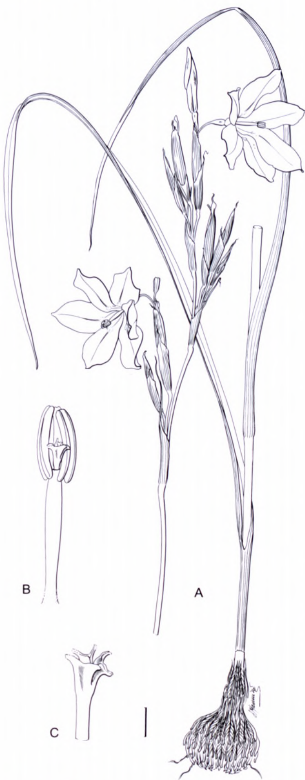
FIGURE 3.— Moraea tanquana , Steyn 872 (NBG): A, corm and flowering stem; B, stamens and style; C, style branches. Scale bar: A, 10 mm; B, 4 mm; C, 2.5 mm. Artist: John Manning.

inner spathe is \pm 30 mm long. The ovary is conspicuously veined with dark red in M. deserticola thus unlike the uniformly green ovary of M. tanquana . Edaphically the two also differ: M. deserticola occurs in the Knersvlakte to the northwest and favours light, loamy clay surrounding limestone outcrops, quite dif-