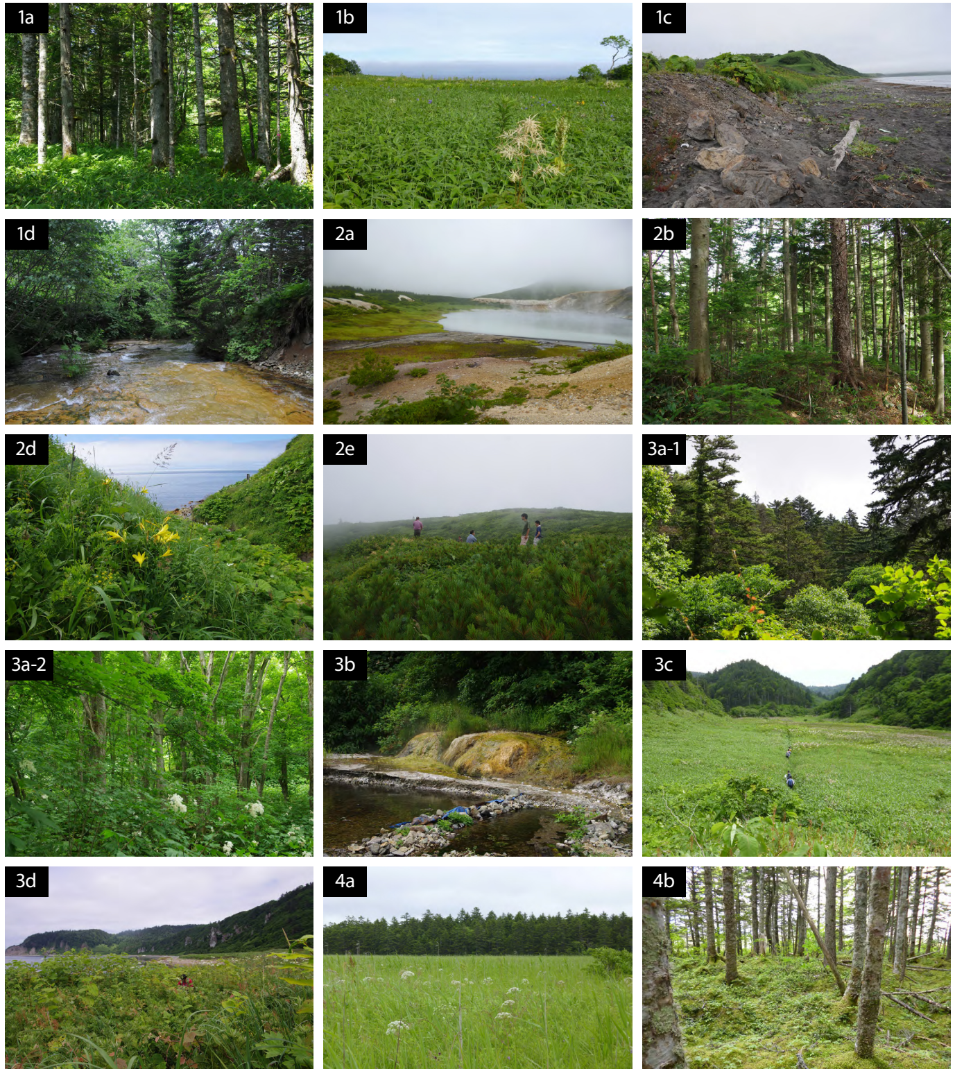
Figure 2. Pictures, showing the habitat of every locality. The number and alphabet correspondent to those in Figure 1. 1a: Andreevka, forest. 1b: Andreevka, meadow. 1c: Andreevka, coast. 1d: Andreevka, river mouth. 2a: Mount Tomari, lakeside bog. 2b: Mount Tomari, forest. 2d: Mount Tomari region, coast near the mouth of Ozernaya River. 2e: Mount Tomari, at mountain pass. 3a-1: Stolbovskyy, coniferous forest. 3a-2: Stolbovskyy, mixed hardwood forest. 3b: Stolbovskyy, hot spring. 3c: Stolbovskyy, wet meadow. 3d: Stolbovskyy, coast. 4a: Furukamappu, bog. 4b: Furukamappu, forest.

4) Furukamappu Bog is located in northwest part of Yuzhno-Kurilsk and consists of well preserved bogs dominated by Sphagnum spp. Picea glehnii forest, one of the most common forests on perhumid (ever-wet) sites in south Kuril and Hokkaido, is also developed in the bog.