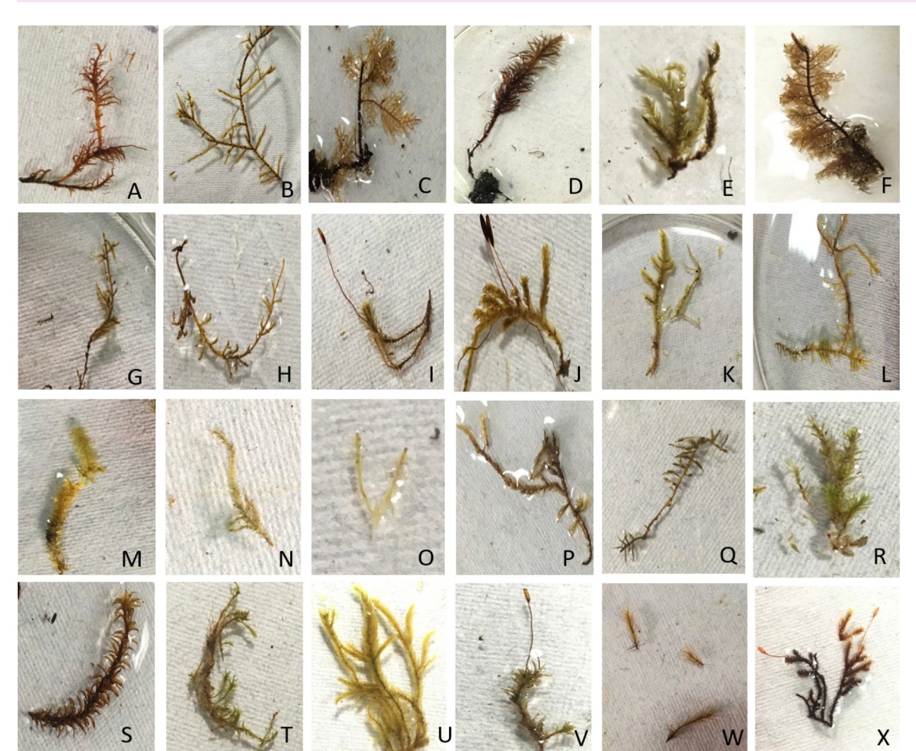
Image 1. Some identified bryophyte taxa: A—Anomodon acutifolius | B—Taxithelium nepalense | C—Thuidium recognitum | D— Polytrichum formusum,E—Barbella spiculata | F—Pelekium velatum | G—Leviereela fabroniacea | H—Macrothamnium leptohymenoides | I—Hymenostomum edentulum | J—Entodon luteonitens | K—Rhynchostegiella divariatifolia | L—Rhynchostegium pellucidum | M— Leucomium decolyi | N—Epiterygium tozeri | O—Amblystegium serpens | P—Homalothecium nilgheriense | Q—Thamnobryum macrocarpum | R—Hydrogonium pseudoehrenbergii | S—Syntrichia princeps | T—Anoectangium stacheyanum | U—Brachythecium kamounense | V— Hydrogonium arcuatum | W—Ditrichum flexicaule | X—Macromitrium perrottetii.

Growing on calcium and magnesium rich substrata, Brachymenium longicolle, Fissidens geppi, F. grandifrons, Gymnostomum calcareum, Hydrogonium arcuatum, and H. pseudoehrenbergii can occupy exposed surfaces of rocks and boulders with no trace of vegetation. Members of Thuidiaceae are widely found and observed under shady conditions, specifically on the thick litter. Turf growth form is considered as dominant in the study area and their distribution can be correlated with local climate. Some green algae are also found to be associated with moss colonies of the collected taxa.