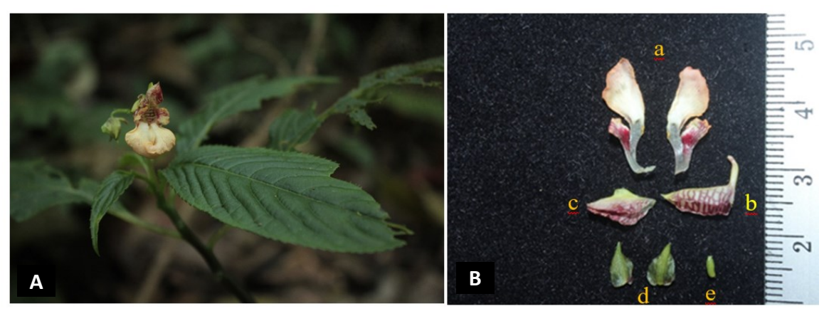
Figure 1. Impatiens buennemeijeri. (A) front view, (B) part of flower. a). A pair of lateral united petals, b). Lower sepal and spur, c). dorsal petal, d). a pair of lateral sepal, e). Gynoecium.

Specimens examined . Sumatra. West. G. Malintang, Bünnemeijer 3739 (BO); G. Sago, July 1918, Bünnemeijer 369 (BO); NU 0254, Feb. 2021.