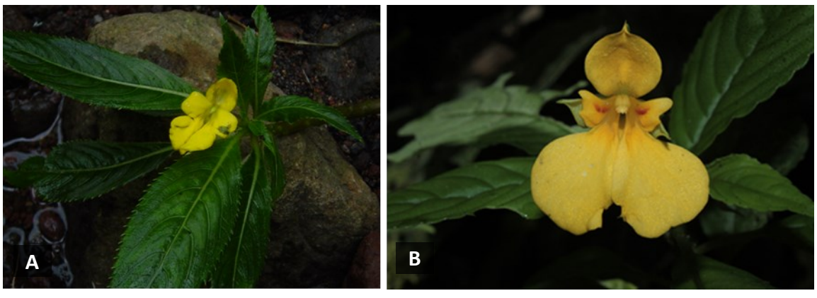
Figure 3. (A) I. singgalangensis Grey-Wilson and (B) I. diepenhorstii Miq.