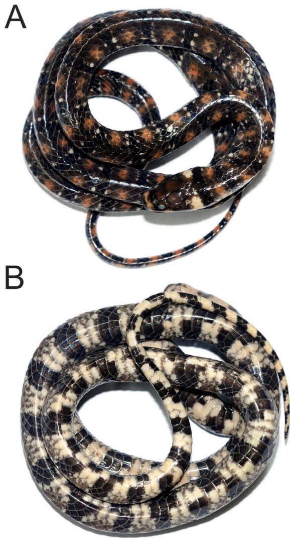
Figure 1. Hydrops martii (CHFURG 5698) from Macapá, Amapá, Brazil: A. Dorsal view. B. Ventral view.